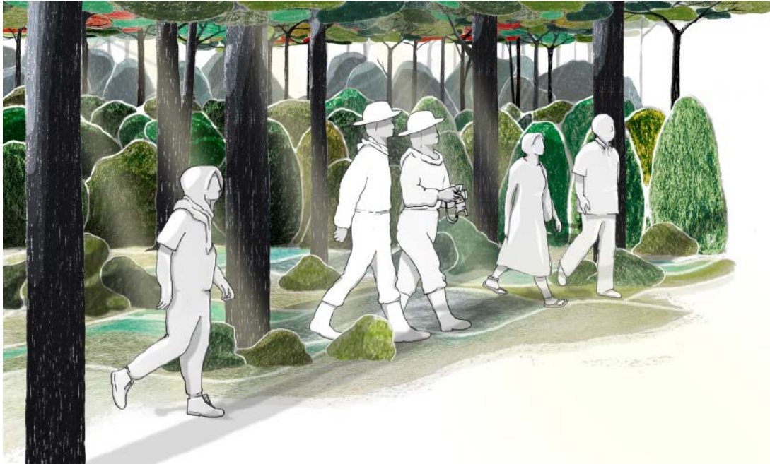
Film 7 “Walking together”: Forensic experts and civil society walking together towards a future of hope and reconciliation.