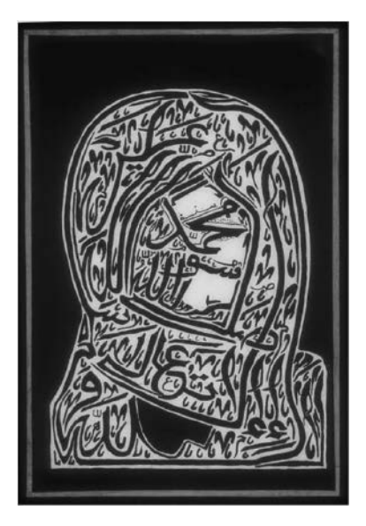
Photo 4 Calligram of Amadu Bamba's based upon Assane Dione's portrait. The Shahada proclamation of Islamic faith is written in Arabic script. UCLA Fowler Museum x99.56.30.

2007: 39–40). Following such revelations, Sufis possessing deeply arcane knowledge can "read" Bamba's countenance as revealed in the 1913 photograph (Photo 4). The image emphasizes the potentiality of batin —the profound signification that stands dialectically between visible and invisible realms. Indeed, in such a mystical image, "certain parts are visible, while others are not; visible parts render the others invisible, and a rhythm of emergence and secrecy sets in, a kind of watermark of the imaginary" (to redirect Baudrillard 1988: 33). Such an assertion recalls Seyyed Nasr's (1987: 128–129) paraphrase of Rumi, that "no reality is exhausted by its appearance," for one must "penetrate into the ma'na [essential meaning] of things" to partake of their "inebriating interiority." Indeed, "the great paradox of Islamic art" is its quest to "represent a reality that cannot be seen" (Laibi 1998: 14). The portrait of Amadu Bamba provides opportunities to reflect upon such profundities.