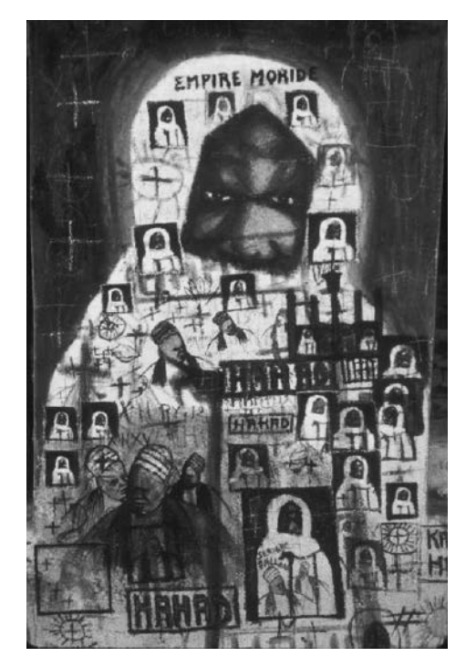
Photo 5 "Empire Moride" vignette of mystical graffiti by Pape Diop on a wall near Soumbédioune fish market in Dakar.

density and contrast (Photo 5). On closer inspection, one soon realized that they telescoped to larger and larger pictures, offering a distinct sense of depth despite their two-dimensionality. Diop made his pigments from the pulverized carbon plates of cast-off automobile batteries mixed with battery acid. As a paintbrush, he used a frayed chewing stick of the sort many Senegalese use to clean their teeth. As Diop's earlier graffiti faded and flaked, their ephemeral nature made them all the more poignant; but in the earlier years of his street-based practice, he often refreshed or painted over his designs, creating palimpsests of pious purpose and presence.