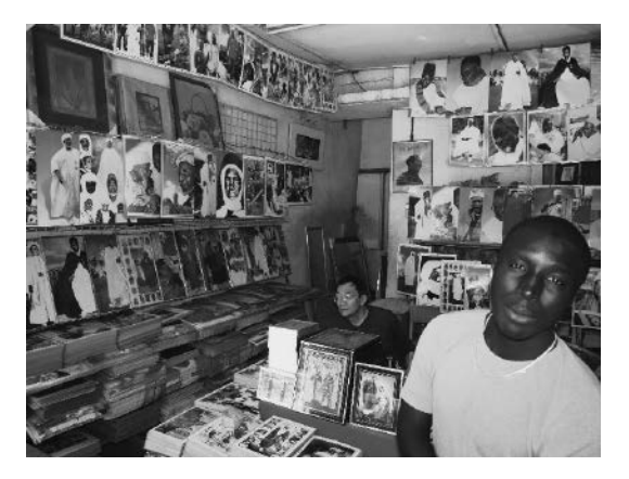
Photo 12 Chinese shop in Dakar selling devotional images photoshopped in the PRC for the Senegalese market.