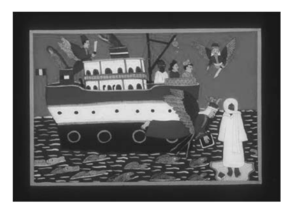
Photo 9 The miracle of Amadu Bamba praying upon the waters, reverse-glass painting by Mor Gueye purchased 1998, private collection.

Photo 8 Image of the miracle of Amadu Bamba praying upon the waters with a Chinese junk (sailing ship) in the background. Montage photoshopped in the PRC and purchased by the author in Dakar in 2011, scanned to produce this image.