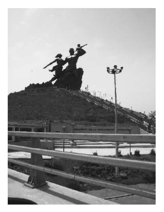
Photo 1 "African Renaissance" monument in Dakar, Senegal.

The firm's fees are said to have been exchanged for a huge grant of land once constituting a portion of Senghor Airport (see De Jong 2010).