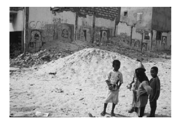
Photo 7 Mystical graffiti by Pape Diop on the walls of a vacant lot near the Soumbédioune fish market of Dakar.

Dakar in 2011 bears a caption highlighting this relationship: "basic cultural values." A local artist originally produced the image as a reverse-glass painting; however, the representation is now photoshopped in and imported from China.<sup>15)</sup> Such a tectonic shift to expropriate—and expatriate—production of what is still considered a basis for social identity stands as a most ironic assertion of what may constitute Senegalese visual citizenship in the age of Abdoulaye Wade's "African Renaissance." In "rebirth" ( renaissance in French), Senegal may be losing rather than confirming its Africanity.