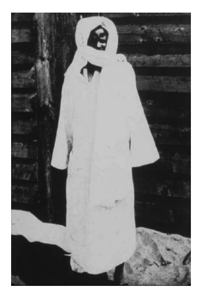
Photo 2 C.1913 photograph of Sheikh Amadu Bamba

Sufis have long referred to the "calligraphy" of the Prophet Muhammad's face as "a marvelously written manuscript of the Qur'an" (Schimmel 1975: 413). His nose is said to have been like an alif , the sweeping stroke with which one begins the Holy Name of Allah, and His eyebrows, the Basmala formula "In the name of Allah" with which one begins prayers or blesses other endeavors. The Prophet's eyes and mouth also suggested letters, as derived from ancient Arabic notions of physiognomy (cf. Courtine and Haroche