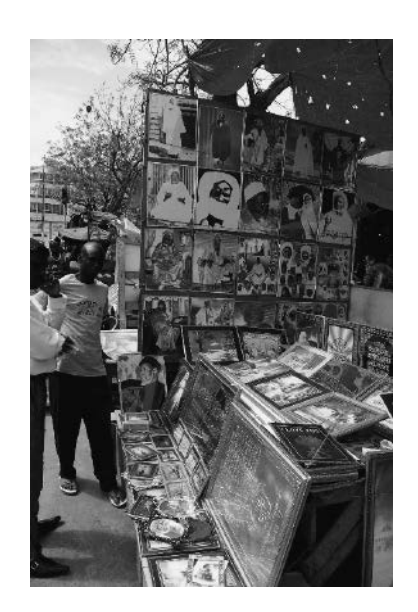
Photo 11 Roadside display of Chinese-produced Senegalese devotional images and other pictures for sale.

occasional "I LOVE YOU" in a snappy plastic frame.