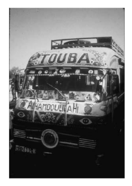
Photo 10 Windshield of a car rapid publictransport minivan in Dakar, displaying photos of Amadu Bamba, his family, and most ardent followers.