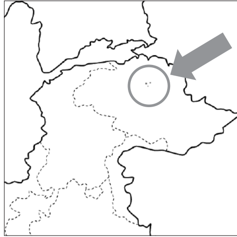
Map 2 Map of the Domaaki language

shown as three dots: Mominabad is to the west, Shishkat is to the northeast, and Beḍishal is to the south. The three points appear to be very close to one another on the map, but in reality, the 30 km journey from Mominabad to Shishkat, and the roughly 15 km way from Mominabad to Beḍishal, both take about an hour by car because of the rivers (bridges) and other intervening topographical features. The ethnic group of the language is Doma 3) . Doma people live sporadically throughout northern Pakistan, in particular in Gilgit-Baltistan. However, most of them no longer speak Domaaki because they have switched to a different major language. 4) Hence, Domaaki speakers are decreasing in number and less than 100 people can speak it fluently; Most speakers are elderly. Apparently, women retain more of the language than men do because, traditionally or conventionally, women, unlike men, have only been able to interact with others within their communities. Lorimer (1939: 5–6) noted that there were approximately 330 Domaaki speakers in 1931. After about 70 years, Weinreich (2008: 299) reported fewer than 350 speakers in 2004, whereas Weinreich (2011: 165) described their number as declining rapidly.