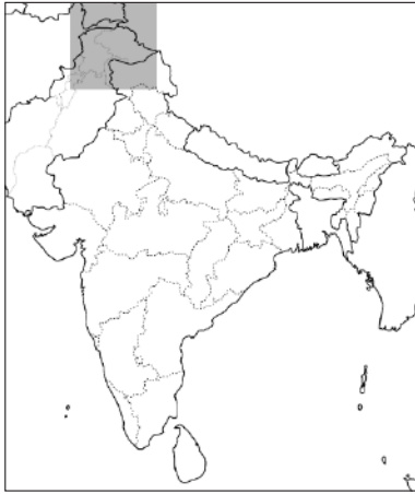
Map 1 Map of South Asia