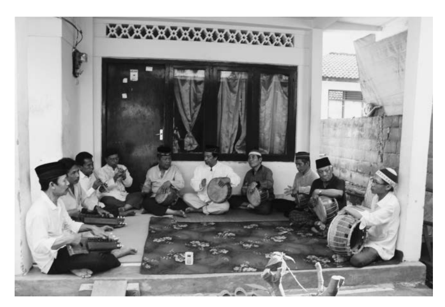
Figure 1 A rebana ensemble in Danginsema, Karangasem, Bali (Photo by the author, 27 December 2013).

The rebana in Nyuling and Danginsema comprise their own ensemble, including: