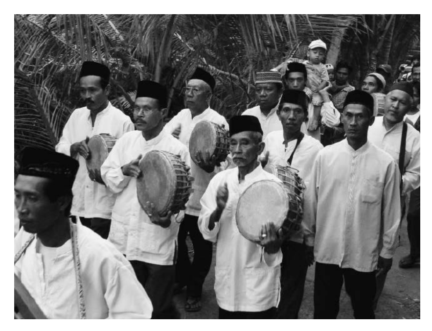
Figure 2 A rebana ensemble in procession. Nyuling, Karangasem, Bali (Photo by the author, 27 August 2006).

bride to Nyuling for marriage. On the journey back to Nyuling, the rebana performed again. The whole event had a festive, joyful atmosphere. The rebana and qasidah performances did much to express the communal identity and tradition of Nyuling through the offering of a lively form of entertainment that had already been extinguished in Karang Ceremen.