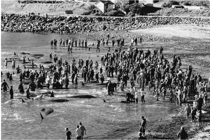
Photo 1 Pilot whale drive hunt

immediately notified of the decision, and they suspend their work and everyday activities and set sail straight toward the whales. Then, under the direction of whaling foremen on the sea, they arrange the ships and boats in a semicircle behind the whales to herd them toward the shore. In the formation, the larger ships position themselves on the edge of the circle, and the small boats, since they can turn around more easily, take the front position. In recent years, gasoline-powered boats have replaced traditional wooden rowboats.