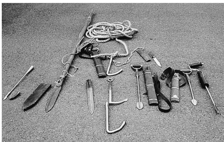
Photo 3 Equipment used in the Faroe Island pilot whale hunts, past and present

blowhole, and the whalers do not have to use undue force to maneuver the whales (Olsen 2015). Another improved piece of equipment is the spinal lance, which is used to cut the whale's spinal cord; it is a 74-centimeter rod with two handles and a double-edged blade (NAMMCO 2014). According to Olsen, the spinal lance has three merits: (1) The handles make it a safe tool for the whalers; (2) It causes the near-instant death of the whale; and (3) Its use means that whalers no longer have to stab the whales repeatedly with traditional knives, which both minimizes the whales' suffering and preserves the condition of the whale meat (Olsen 2015). The spinal lance has been officially required in the whale hunt since May 2015 (Ministry of Foreign Affairs and Trade 2015). Impressed by its efficiency, the whalers in Taiji have adopted the spinal lance as well.