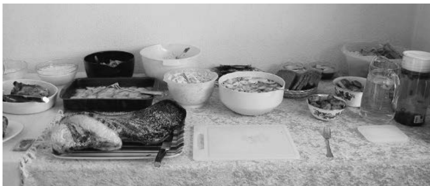
Photo 3 Mattak served on birthday celebration (Photo by Shunwa Honda, 2015)

what rituals and ritual activity related to whaling noted in early ethnographies are carried over into contemporary Greenlandic society. I quote a few examples from early ethnographies: