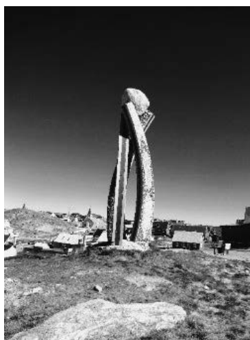
Photo2 Whale jawbone shape object in Nuuk

how closely whales are woven into the fabric of Greenland history and identity. This fact is noted by many researchers of Greenland history and society. For example,