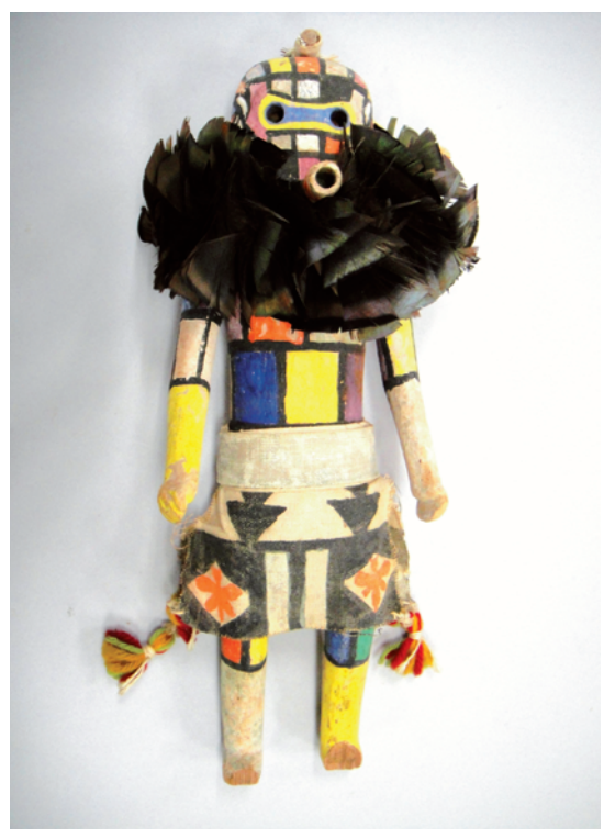
"H0075679" of Minpaku. (July 8, 2009)