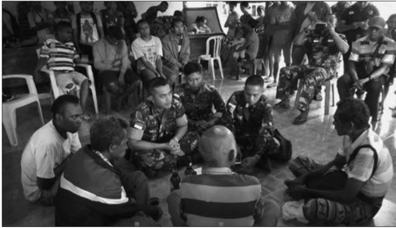
Figure 3 Ritual of reconciliation

ered here today have accepted the apology. There shall be no raking over old ashes, and no leaking of wrong information outside the village’.