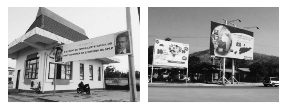
Figures 3, 4 Welcome banners for CPLP members.

The government of Timor-Leste has requested to join the Association of Southeast Asian Nations (ASEAN) since 2002, but has not yet been accepted, as ASEAN members are concerned with the unstable social conditions in the country. Until Timor-Leste can gain enough power as an established nation, it will have difficulty becoming a member of an association that attaches importance to economic and political relations between members.