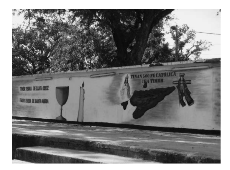
Figure 5 Motael Church in Dili, 'Tinan 500 Fe Catolica iha Timor – 500 years of Catholic faith in Timor'.

To embrace a language that has not been properly disseminated in Timor-Leste