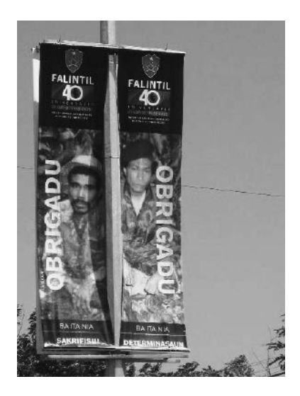
Figure 1 Banner with a borrowed word.

Figure 2 shows a notice about computer lessons written in Tetun. In this notice, there are more than thirty-five borrowed words (Table 1); it is therefore relatively easy to understand for Portuguese speakers. A student I interviewed at the national university told me that today's Tetun is mixed with Portuguese, and that this explains why Timorese people cannot understand Tetun writing; according to this student, only Portuguese-speaking foreigners can use this written language, and