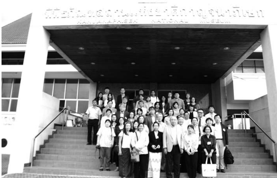
International Joint Research Meeting on Preventive conservation. Kanchanaphisek National Museum and Central Storage, August 25, 2014.