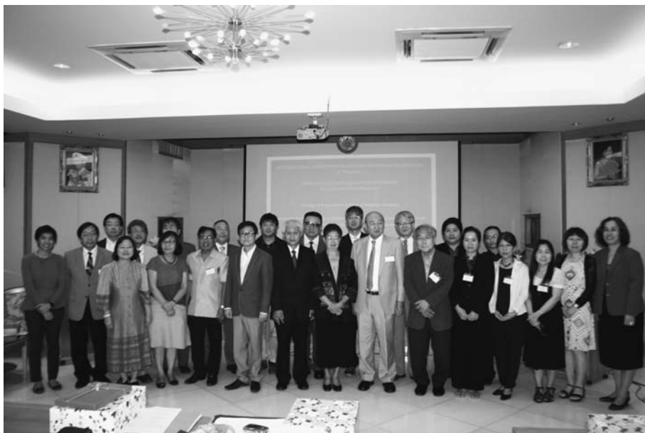
JSPS Core-to-Core Program Public Seminar "Social Roles of the Museum". National Museum Bangkok, Auditorium, August 26, 2014.