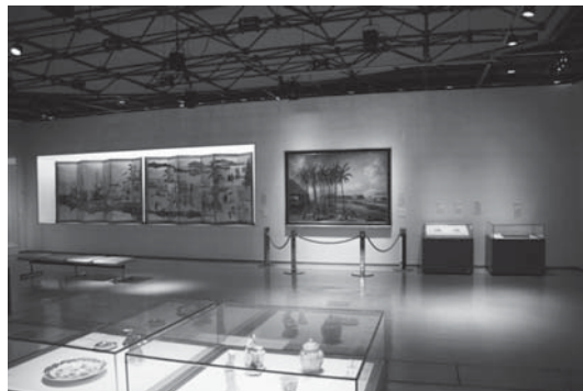
Figure 4 Exhibition held in Osaka at National Museum of Ethnology.

“Self & Other: Portraits from Asia and Europe” is a travelling exhibition, which has been created through a collaboration between museums and art museums in 18 countries in Asia and Europe, who are members of the Asia-Europe Museum Network (ASEMUS). I played the role of a co-coordinator on the Asian side, with Brian Durrans of the British Museum who did the same on the European side. This exhibition, ‘Portraits from Asia and Europe’, asked how people in Asia and Europe have understood the self and how they have accepted each other through the course of history. Shifts in such perception were traced through ‘portraits’, broadly understood. It was indeed a multi-vocal exhibition that contained various voices. The exhibition was held in 3 cities in Japan between 2008 and 2009, in London in 2011, and in Manila in 2012. In Japan, especially in Osaka and in Kanagawa near Tokyo, the exhibition was held at two venues, one at an art museum and the other at an ethnological or a historical museum, under the same title, at the same time, during the same period (Figures 4 and 5). The challenge was another trial to question