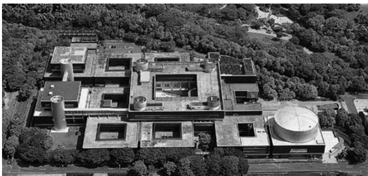
Figure 1 National Museum of Ethnology, Japan.

Minpaku opened to the public in 1977 (Figure 1). More than 30 years have passed since then. During this period, the world has changed significantly. Academic paradigms as well as exhibition paradigms have also undergone major shifts. Under such circumstances, we had decided to refurbish the entire permanent exhibition at our museum, beginning with the Africa and West Asia Galleries, which opened in March 2009. Following these two galleries, we have been refurbishing basically two galleries every year; Music and Language galleries in 2010, Oceania and the Americas galleries in 2011, Europe gallery and Information Zone in 2012, Japan gallery in 2013, and the new China and Korea galleries opened in March 2014. The completion of the refurbishing project is scheduled to be in 2016, requiring a further