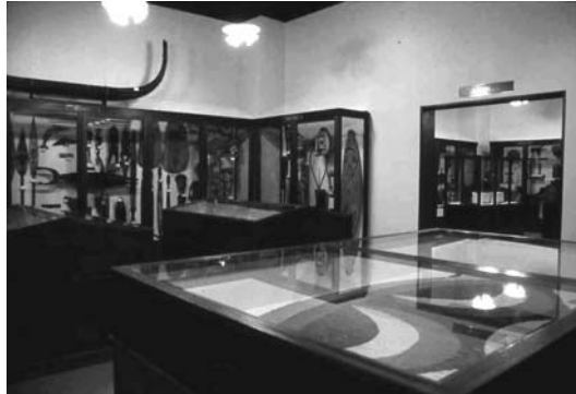
Figure 3 Reproduction of the ethnographic gallery (Oceania) of the British Museum as it was in 1910.

hand, in the works by Max Ernst, “Janus,” and by Joan Miro, “Bird Figure,” there are evident connections to African masks and carvings. However, this tendency to create one’s own world of expression while incorporating elements of other cultures is not something only seen in modern art. The same tendency can be recognized as something also shared by the contemporary designs of the African coffins, the Oceanic shields, presented here. Given this, we need to ask why we call only one side “art” and the other “ethnographic materials”. Why do we collect one in modern art museums and store the other in ethnological museums?