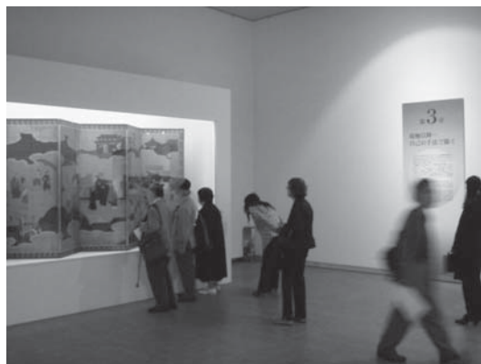
Figure 5 Exhibition held in Osaka at the National Museum of Art.