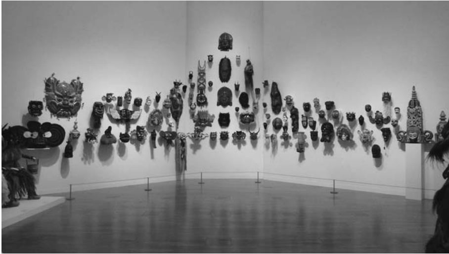
Figure 6 100 masks from all corners of the world were on display in prologue section at the National Art Center, Tokyo.

ancestors from the past are recounted in our stories and also incorporated into images. Attempting to visualize a narrative is essentially an act of portraying time. In this section, we take a wide-ranging look at various methods of depicting time throughout the world, including an illustrated biography of Buddha, a Christian icon, and tree-bark paintings of the Aboriginal Australians.