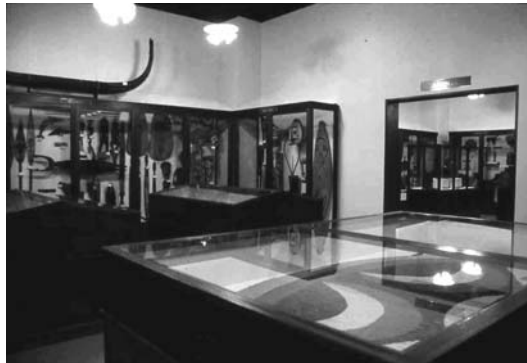
Figure 3 Reproduction of the ethnographic gallery (Oceania) of the British Museum as it was in 1910.

hand, in the works by Max Ernst, “Janus,” and by Joan Miro, “Bird Figure,” there are evident connections to African masks and carvings. However, this tendency to create one’s own world of expression while incorporating elements of other cultures is not something only seen in modern art. The same tendency can be recognized as something also shared by the contemporary designs of the African coffins, the Oceanic shields, presented here. Given this, we need to ask why we call only one side “art” and the other “ethnographic materials”. Why do we collect one in modern art museums and store the other in ethnological museums?