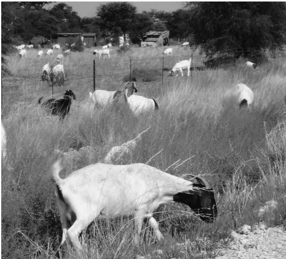
Figure 4 #Khomani sheep and goats on Andriesvale farm.

Surprisingly, Bradstock found that farming activities generated only 0.2 to 4.2 percent of #Khomani family income: ‘[I]n spite of the fact that [they] are beneficiaries of the land reform programme there is no evidence to show that agriculture is a key livelihood activity [among the #Khomani]’ (Bradstock 2006: 255). Bradstock’s findings should not be viewed as suggesting that no one on the #Khomani farms is raising livestock. Indeed, many of my interviewees, including Andries Steenkamp and Dawid Kruiper, owned at least some sheep or goats. (See Figure 4.) What Bradstock’s results do indicate, however, is that very few #Khomani were generating income from stock-farming in 2006, despite their collective ownership of 36,889 hectares of farmland. As will be discussed below, despite less ‘anarchy’ on the #Khomani farms today, this largely subsistence-level