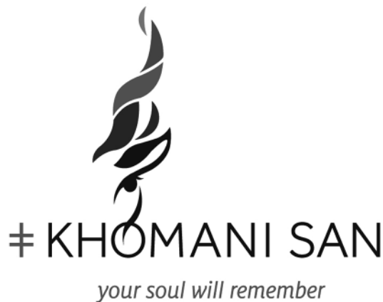
Figure 8 New #Khomani logo found on their website, correspondence, marketing material, signage, and uniforms and to be used on future branded products.

rather than leading to #Khomani fracture, has actually begun to bring some #Khomani unification under an emerging sense of San cultural identity and pride, because the culturally appropriate organisational forms that are constitutive of the San identity have been given the space to emerge.