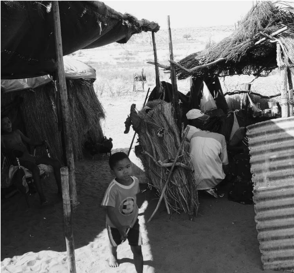
Figure 2 Typical #Khomani self-built home.

the DLA lays out the following goals, definitions, and policies: