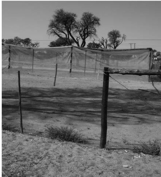
Figure 7 Remains of the SASI vegetable garden, an example of a failed 'development' project for the #Khomani 'community'.

how this last CPA Committee took and used community funds: