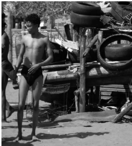
Figure 5 #Khomani man wearing traditional San clothing in Welkom.