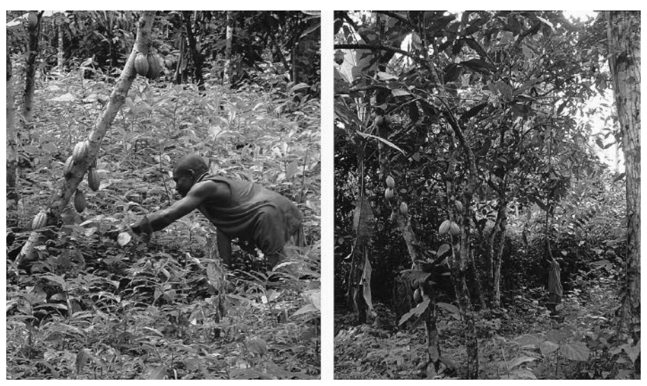
Photo 1 Cacao harvest work. Dieudonné (left) collecting low-hanging cacao fruit using a machete and a Baka youth (right) harvesting fruit from a high branch. (Photographs by author, September 2007)

Dieudonné receives help from the Baka not only during the harvest, but at all stages of cacao production, including field clearing, cacao fruit inspection, and the application of chemicals (Table 1). The harvest work, lasting five hours each day, was repeated day after day. Both the Baka youth and Dieudonné were exhausted. The cacao harvest season is the busiest and most difficult season for male farmers.