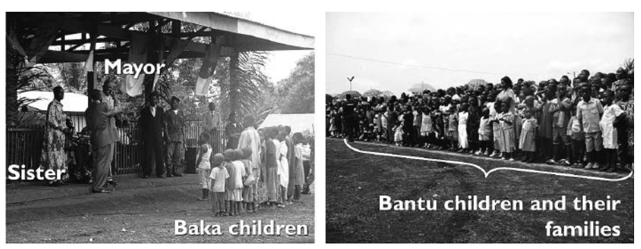
Photo 3 Separation of Baka as a "Minority People" (Children's Day at Salapoumbe Town, February 11, 2007)

This situation shows exploitation of Baka by Bantu. The mission emphasizes the need for sedentarization, farming, and school education for their independence from the Bantu. During the 1970s, the Catholic mission began to aid the Baka living along the main road by offering a free clinic and school. The Catholic mission designated the Baka hunter-gatherers as a "Minority People" and has been active in efforts to assist this group. The perception of the Baka as a minority people still exists. Photo 3 shows Children's Day on 2007. It was held for the Baka children in front of Bantu children, and their families. The mayor and missionary gave notebooks only to Baka children. While the missionary focused on activities for the Baka, the missionary built the Institution for Rehabilitation in the East Region. In 1995, they provided short-term rehabilitation for the Baka children along the main road in the Boumba-Ngoko area.