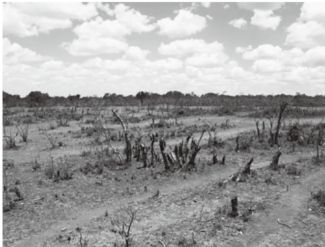
Figure 2 Deforestation around clustered settlement (Photographed by the author in East Africa in August 28, 2009)