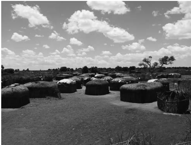
Figure 1 Clustered settlement