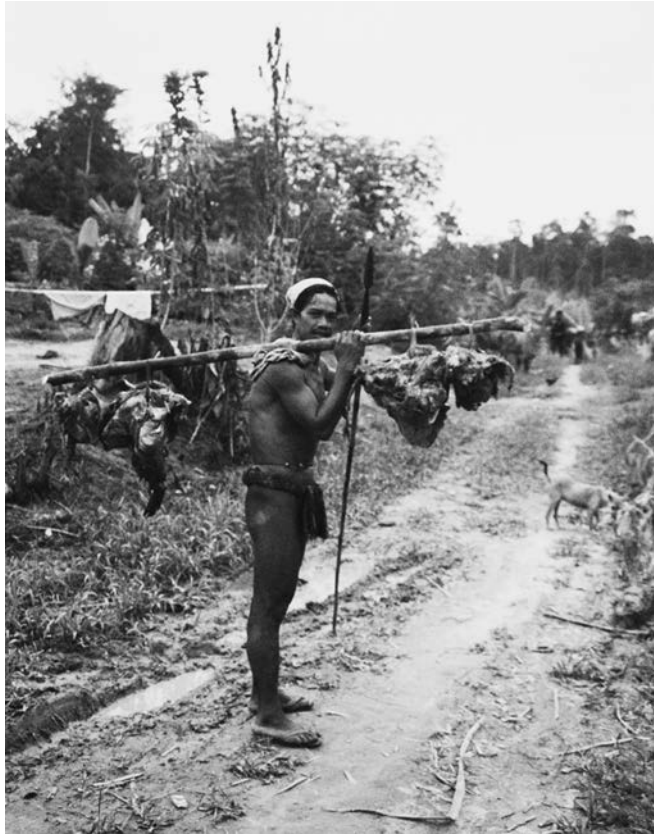
Photo 1 An Orang Rimba male with the results of a long day hunting for wild boar.

percent of the average annual increase in Crude Palm Oil (CPO) production. The area of plantation had increased from 106,000 ha in 1967 to 2.5 million ha in 1997. Jambi is one of the largest oil palm plantation areas in Indonesia, along with North Sumatra, Riau, South Sumatra, West Kalimantan and Aceh.