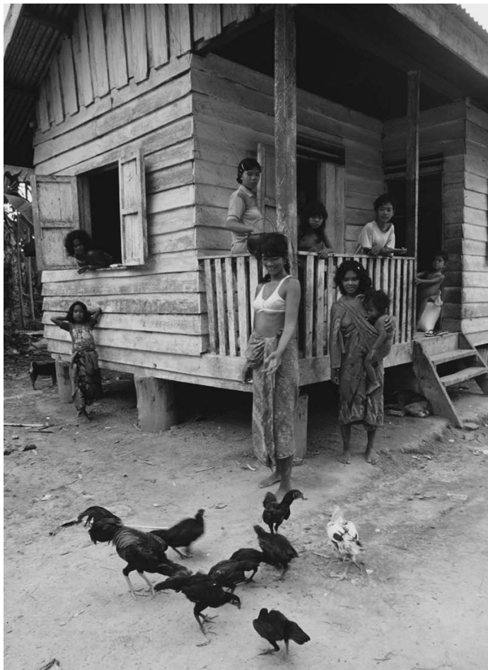
Photo 3 Orang Rimba housing in the resettlement project in a development program developed by the Jambi Province Government.

According to the MOSA, one of the measurements of a community's advancement is a stable life, as indicated by a permanent settlement pattern (Photo 3). The nomadic tradition of the Orang Rimba is to keep moving in order to seek