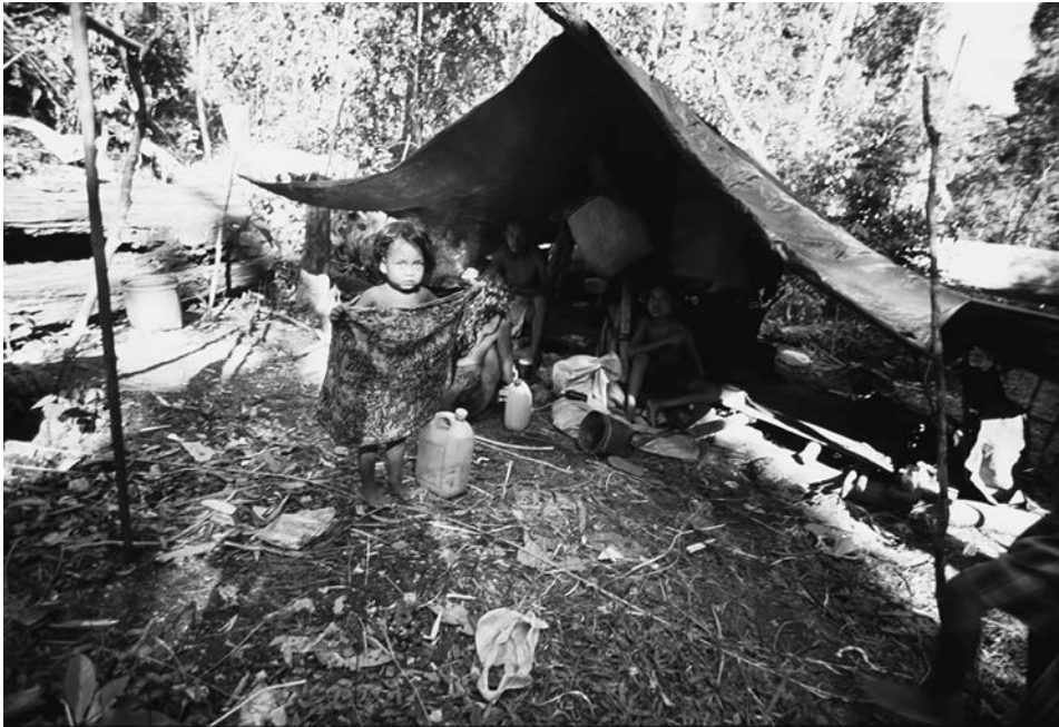
Photo 2 An Orang Rimba camp in the border area between a Malay village and the forest. (Photograph by Riza Marlon/KKI WARSI, 1998)