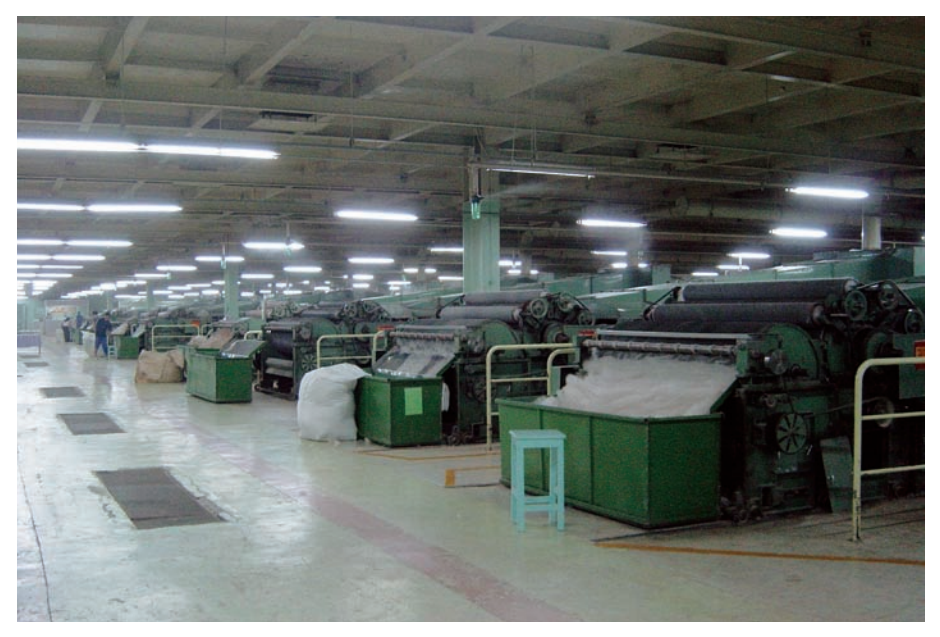
Inside the cashmere plant of The Gobi Company