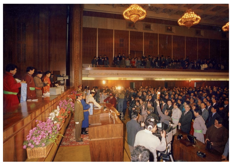
Ts. Lookhuuz as the deputy chairman of the Great people's Assembly (at the center of the top stage) after passing the new Constitution (1992)