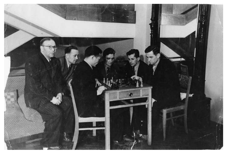
Ts. Lookhuuz together with students of the party-school of the Communist Party of the Soviet Union in Moscow (1952)