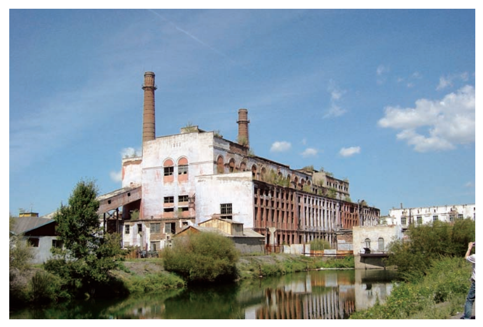
Outside the first electric power plant