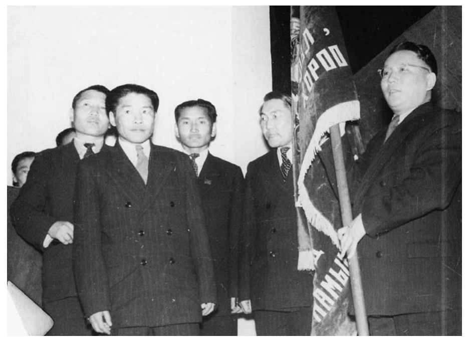
B. Nyambuu as the first secretary of the MPRP-committee of the South-Gobi (1956-62), together with Yu. Tsedenbal (in front)