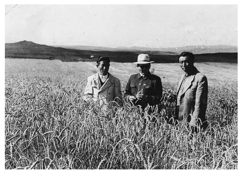
Ts. Lookhuuz (in the center) as the deputy minister of agriculture (1959)