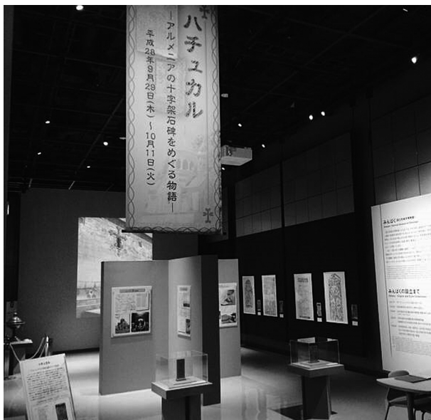
Figure 5 A general view from the Exhibition showing the spatial arrangement of the cross-shaped panels.

Moreover, a separate workshop staged on two separate dates was held to further enhance direct communication of the information in the exhibition to visitors. This interactive workshop titled “Experimenting Taku-hon through Armenian Khachkars” (Figure 6) was held to enhance understanding and experience of Khachkars as symbols of Armenia. Visitors were given materials to make their own versions of Khachkar- Taku-hon in order to appreciate the intricate detail and beauty of these cross stones, as well as to briefly experience becoming “masters” of Khachkar carving. This allowed the visitors to connect on a deeper and spiritual level with the idea and symbolism of Khachkars that hold a vital value to Armenians as a Christian nation.