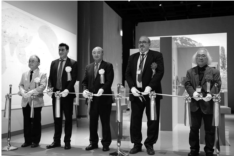
Figure 1 A scene from the opening ceremony of the exhibition, “The Story of Khachkar: Armenian Cross Stones.”