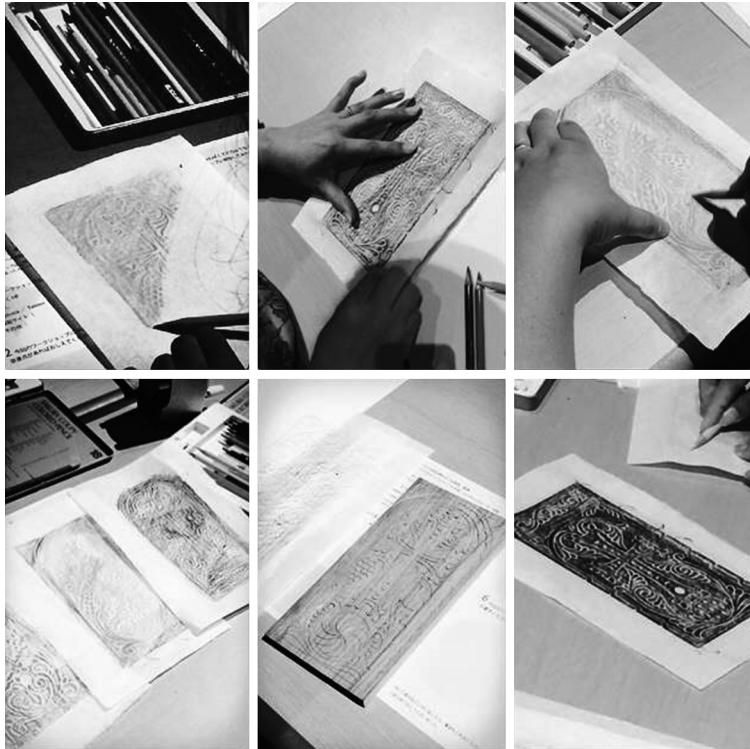
Figure 6 Several views and examples of the process of making Taku-hon from the workshop, “Making Taku-hon through Armenian Khachkars.”