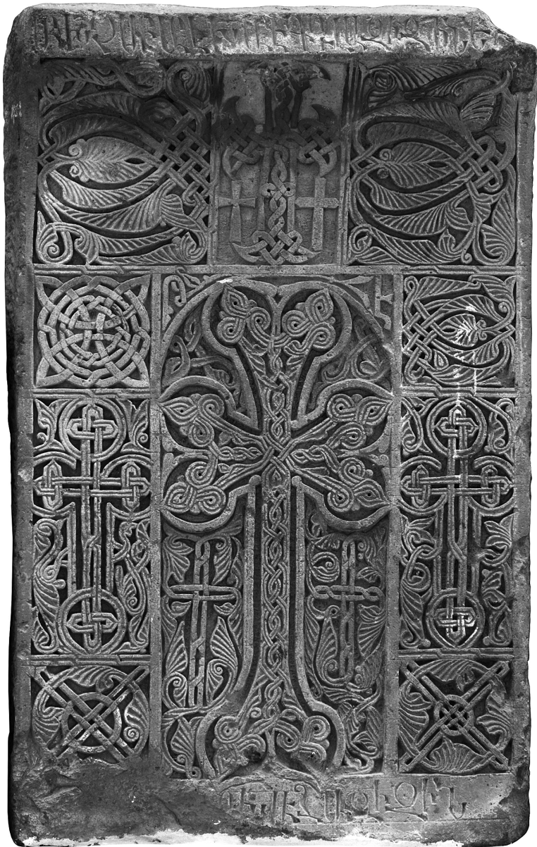
Figure 3 Original Khachkar sample from the collection of Yerevan History Museum, Yerevan, Rock stone, 112×74×22 cm (Inv N 11555-2).