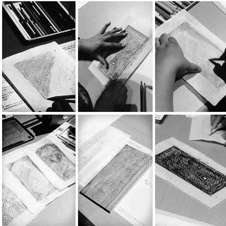
Figure 6 Several views and examples of the process of making Taku-hon from the workshop, “Making Taku-hon through Armenian Khachkars.” Source: Photograph by author, October 2016