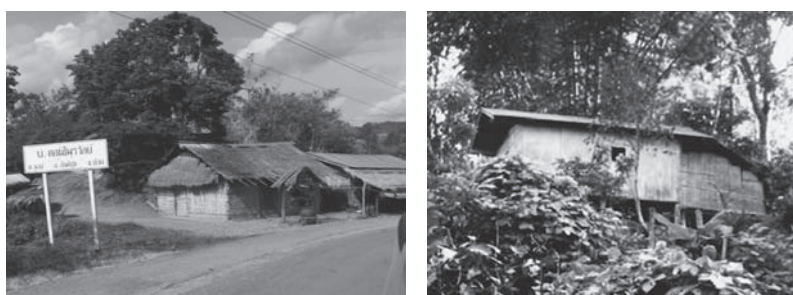
Figure 3 The Mlabri settlement in Don Priwan village, a house (right) belongs to Mlabri, located on a foothill

Don Priwan is a Hmong village, located in eastern Nan Province close to the Thai-Laos. border The few Mlabri living there at present were part of a larger group that moved around 1967 together with the Tin (also known as Lua, Hmal,