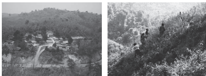
Figure 2 The Mlabri settlement in HuaiYuak village in 2009

This village was initially inhabited by Hmong who settled there in 1975 after moving from Doi Phukeng Village, located on Mount Phukeng close to the Huai Yuak Valley. However, the Mlabri had inhabited and used the forests around this area long before the Hmong community settled there. In 1999, the government initiated the Mlabri development project and convinced them to live together in a single location near the Hmong. Since then the Mlabri population has gradually increased, as is demonstrated by the population change between 1995 (before the settlement project) and 1998–1999 (beginning of the State-led settlement project). One reason accounting for that increase is that the Mlabri were forced to move from the resettlement project in Ban Luang District after a conflict between the government and local farmers over forest occupation (Na Nan 2009: 233).