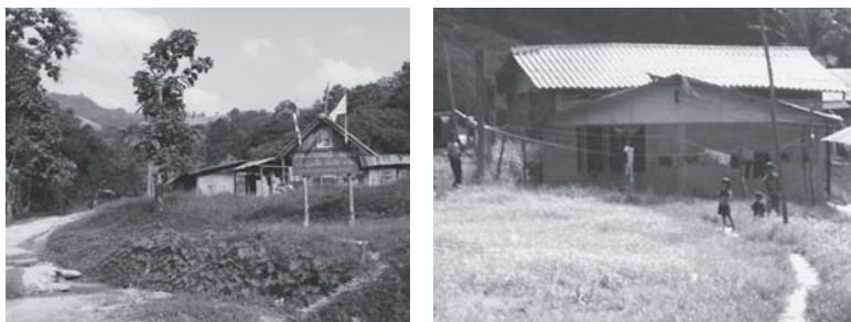
Figure 5 The Mlabri in Huai Hom village

Huai Hom is one of the Hmong villages that were settled on a development project headed by the “New Tribes Mission”. The Mlabri community is settled at