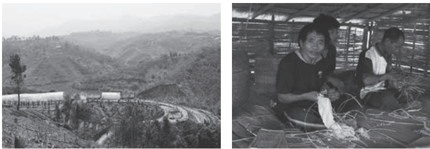
Figure 4 The Mlabri at the Phu Fah development center

Previously, this area was inhabited by Tin people who were located in eastern Nan Province, close to the Thai-Laos border. The Phu Fah Development Center, founded in 1999, is used as an office for HRH Princess Sirindhorn for demonstrating eco-friendly agricultural practices and sustainable development to improve highlander livelihoods. The Mlabri started to be introduced there in 2008 and were originally living in Huai Hom. In 2008, there were only 15 Mlabri. Then, in 2010, their number increased to 61.