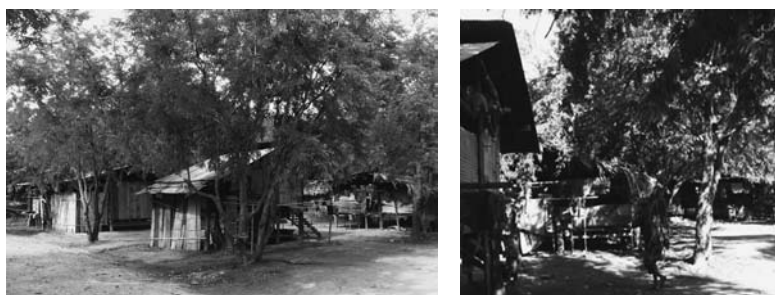
Figure 6 The Mlabi in Tawa village

Tawa is a Tai Yuan village located in northern Phrae Province, near Nan on the edge of Ban Luang District. Topographically, this area is mountainous with only 20 percent of its area being flat. Under the initiative of HRH Princess Sirindhorn, the Mlabri development project, aimed at settling the community in one place, started its operation here in 2007.