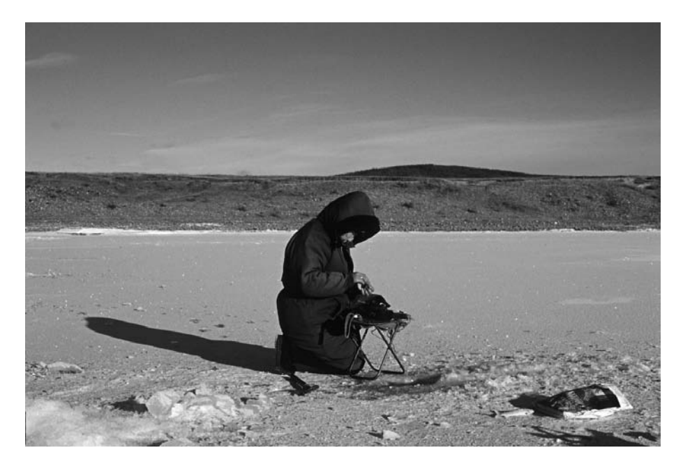
Figure 2 Fishing (photographed by authors in Ust-Dzhilinda (Republic of Buryatia) in 2008)