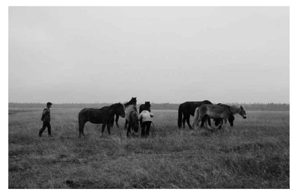
Figure 1 Horse breeding (photographed by authors in Jirga (Republic of Buryatia) in 2006)