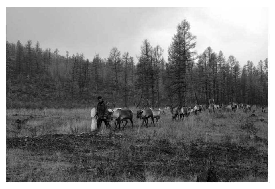
Figure 3 Reindeer herding (photographed by authors inTaloi (Republic of Buryatia) in 2008)