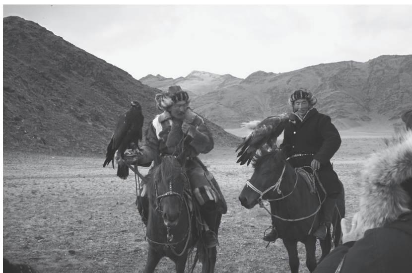
Photo 2 Kazakh hunters with eagles in Sayat Tolgoi Bugat, 2013.