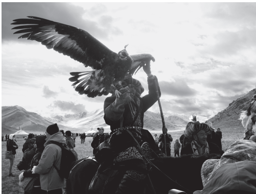
Photo 4 A Kazakh hunter showing his eagle to spectators in Sayat Tolgoi Bugat, 2013.