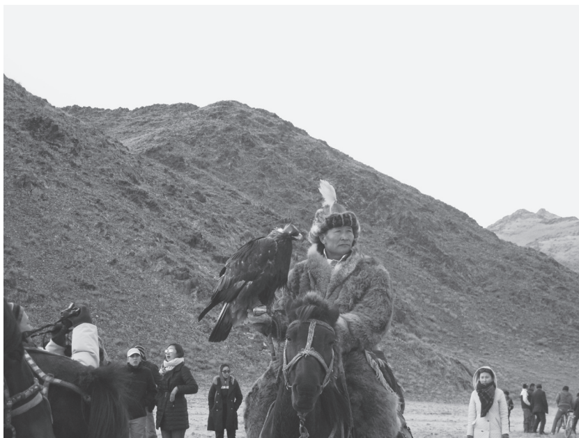
Photo 3 A Kazakh hunter in Sayat Tolgoi Bugat, 2013.