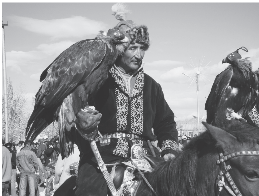
Photo 1 A Kazakh hunter with his eagle in Ölgii City, western Mongolia, 2007.

Atai 2014). Feeding eagles makes a valuable contribution to mankind's history of feeding wild animals. For a man, feeding an eagle represents a personal accomplishment, a kind of sport, as well as a good way to spend leisure time (Photos 1, 2, 3, 4).