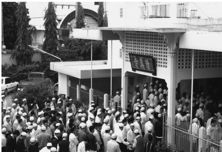
Photo 6 Chinese Muslims gather at a Chinese mosque for the “ Id al-Fitr ” ritual (Breaking of the Fasting) in Chiang Mai.