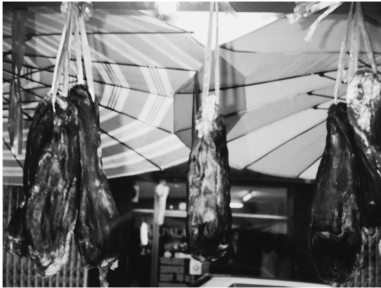
Photo 1 Traditional Chinese Halal food called “ niu gan ba ” (牛干巴).