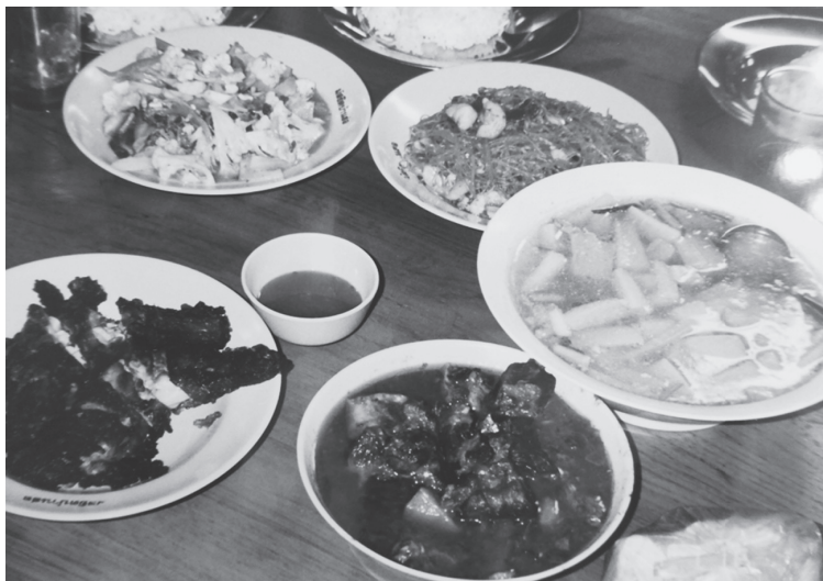
Photo 4 Local Chinese, Indian, and Thai style food served at a Chinese mosque during Ramadan.