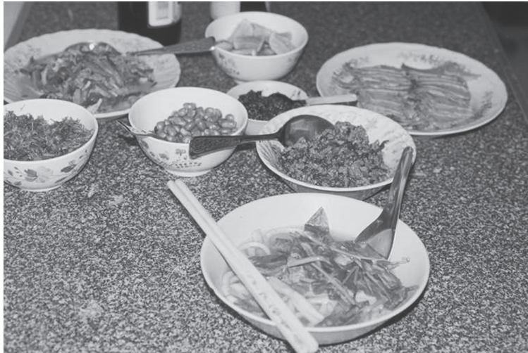
Photo 3 Traditional Chinese noodle with beef called 巴巴絲 ( ba ba si ) served on the morning of the “ Id al-Fitr ” ritual.

Thai dishes (Photo 4). Curry with potatoes and ginger, said to be an almost indispensable part of the meal, appears on the table. This dish, called kaen nuea in Thai, is not a Chinese dish but rather an original dish of South Asian Muslims. Its ingredients are completely different from the Thai dish of the same name. The Thai dish is made with stir-fried cellophane noodles called phat wun sen . Usually a South Asian curry dish is placed as the main dish in the middle of Chinese dishes lined up on the table for the