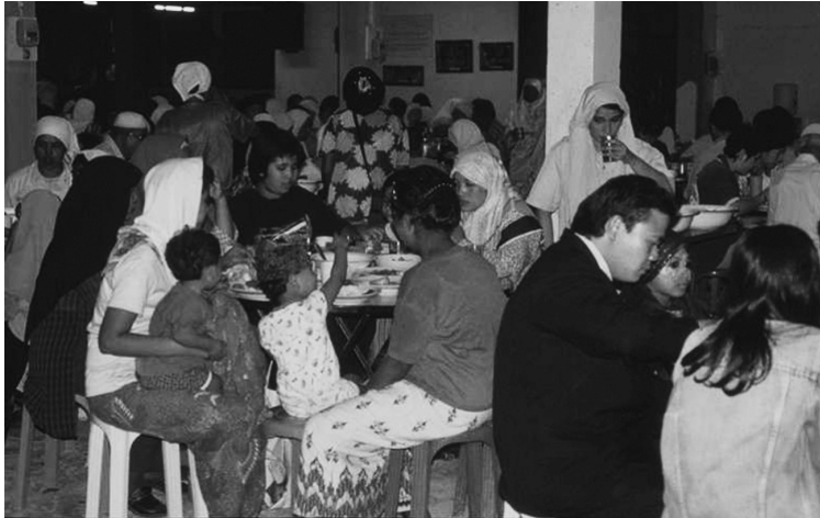
Photo 7 Myanmar and South Indian Muslims sitting together for dinner during Ramadan in a Chinese Mosque.

almsgiving ( zakāt or ṣadaqa ) is ordered by God and that good deeds will enable them to go to heaven. The month of Ramadan is the holiest month of the year and becoming a host during this month helps one achieve a great meritorious deed, which will be rewarded more than usual by God. Such belief prompts Muslims to take an active part in religious events.