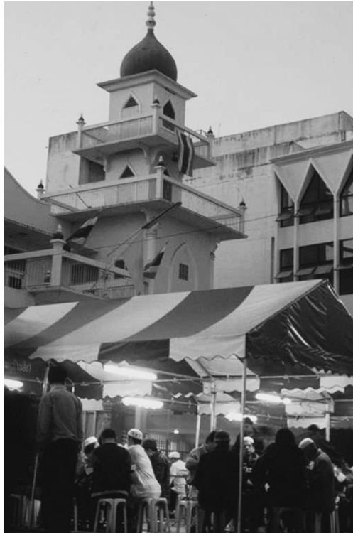
Photo 5 Chinese Muslims gather around a mosque during Ramadan, the month of fasting.