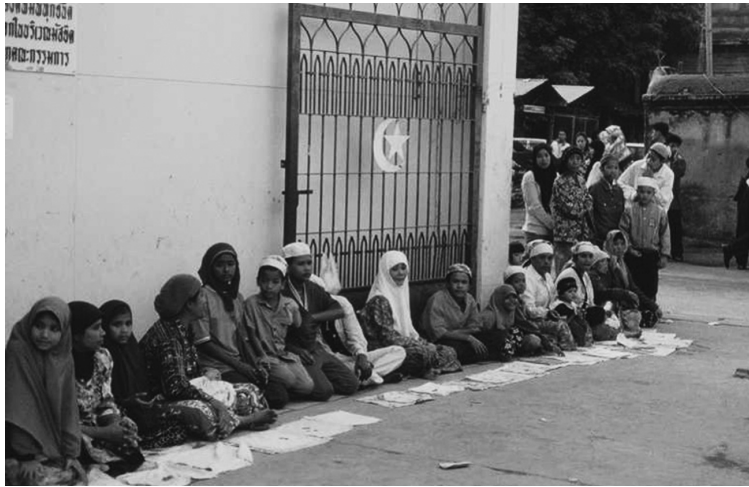
Photo 8 Non-Chinese Muslims beggars waiting for alms from Yunnanese Muslims on the morning of the “ Id al-Fitr ” ritual.

construct social spaces based on ethno-religious identity, which is shown in the construction of Yunnanese mosques. The mosques they constructed thus created a space for social bonds with their relatives and friends of Yunnanese origin. This caused an awakening of Islam in a form that bridged the gap between those Muslims who lived dispersed in the refugee villages and those who had arrived earlier and moved to urban cities. Nevertheless, what is important here is that their religious activities not only serve to maintain their ethno-religious identity, but also to create a communal place beyond ethnic boundaries in a multi-ethnic society. The fasting month of Ramadan especially serves to transmit a culture and a religious identity to succeeding generations. It is also an important occasion for Chinese Muslims to “make merit” through the performance of good deeds for both themselves and others. Moreover, Ramadan functions as an occasion when non-Chinese can share food and receive donations from the Chinese community. These religious practices of the immigrants indicate precisely the kind of “bottom-up coexistence” that unfolds through autonomous choices of the immigrants themselves and according to a logic that is quite dissimilar to the state’s policy of assimilation.