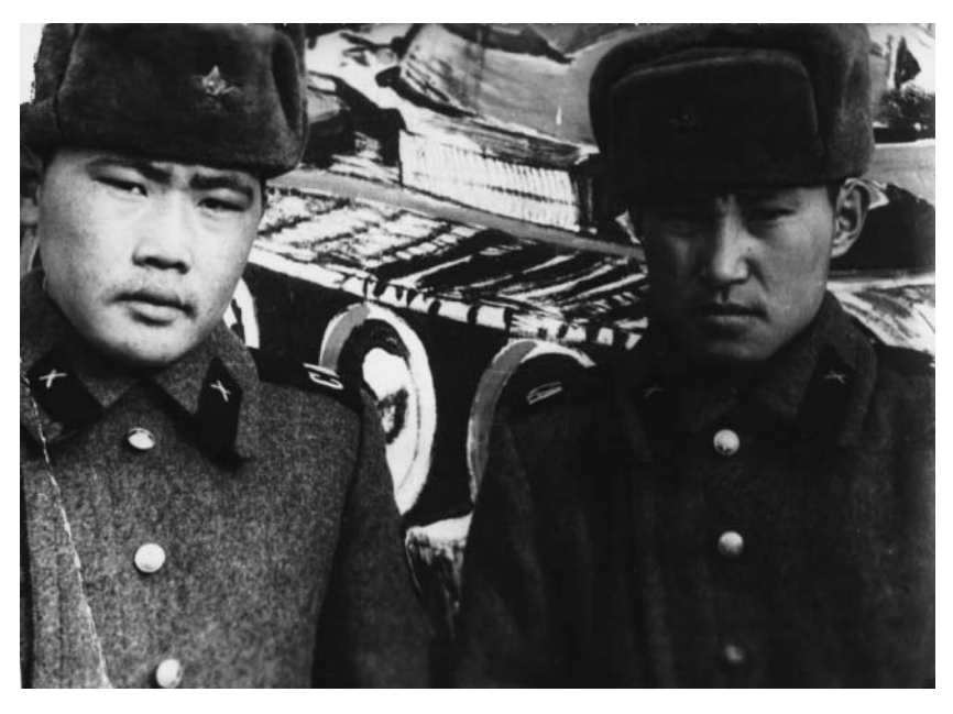
Figure 1 Buryat soldiers on the heavily militarized Soviet-Mongolian and Mongolian-Chinese borders. 1972. Photocopy from A. S. Tokurenov's private album.

soldiers, the free movement of them and their equipment along Mongolia's external borders, building a variety of structures to enhance physical evidence of the borders, and encouraging people to see them as sources of aggression and instability (Figure 1).