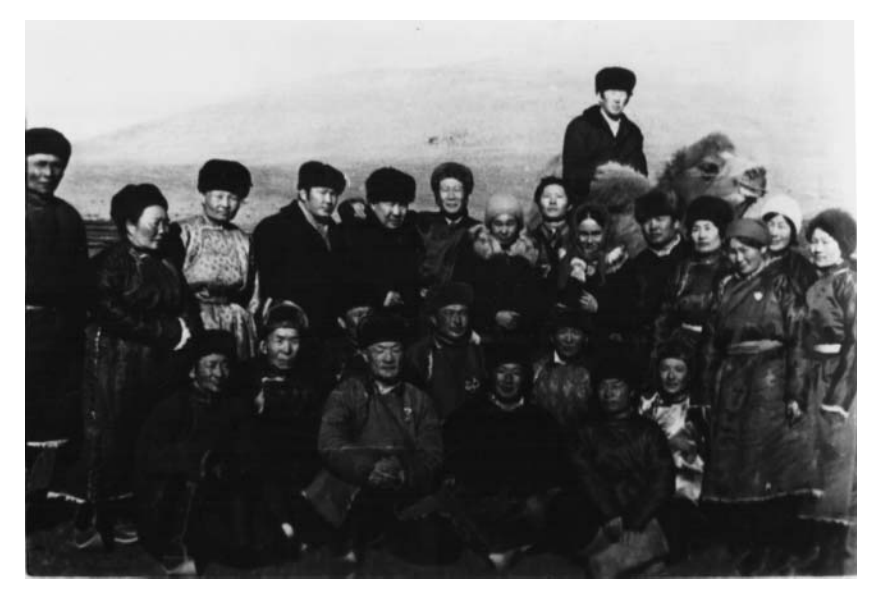
Figure 4 The Buryat delegation from the collective farm called 'Lenin' (dressed in western style clothing) in Hovsgol aimag of Mongolia. The members of the Mongolian collective farm "Altan Tala" in traditional Mongolian dress. 1979.