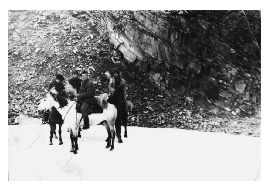
Figure 6 The frontier crossing on an old road in the mountains, on the Mongolian side of the border. The weather was unpredictable, even with snow during the summer. 1985.

Herdsmen felt less emotional about crossing the border over an uncontrolled old path, than crossing the border through official checkpoints. The less formal boundary crossing, and the possibility of smuggling, weakened the sense that they were crossing an