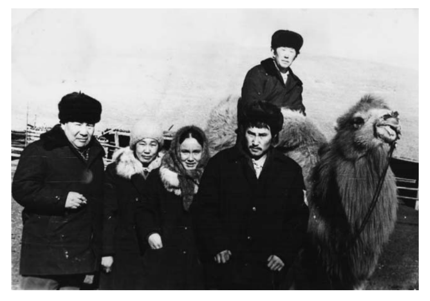
Figure 5 The Buryat delegation from the "Lenin" collective farm in Hovsgol aimag of Mongolia in 1979, during their visit to the collective farm "AltanTala." Source: photocopy from A. S. Tokurenov's private album.

Figure 4 The Buryat delegation from the collective farm called 'Lenin' (dressed in western style clothing) in Hovsgol aimag of Mongolia. The members of the Mongolian collective farm "Altan Tala" in traditional Mongolian dress. 1979. Source: photocopy from A. S. Tokurenov's private album.