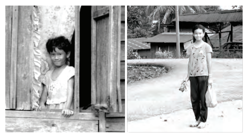
Plates 39 & 40: A growing girl. This girl was three years old in 1998 (Plate 39). In 2008, she stayed in a hostel to attend lower secondary (middle) school, having done well at primary school the previous year. [NT-1998, 2007]

This is a practice where the women themselves select the leaders to protect them. Titleholders should relinquish their titles if they incur opposition to their leadership from the women within their own waris . In short, the women decide who the leaders are.