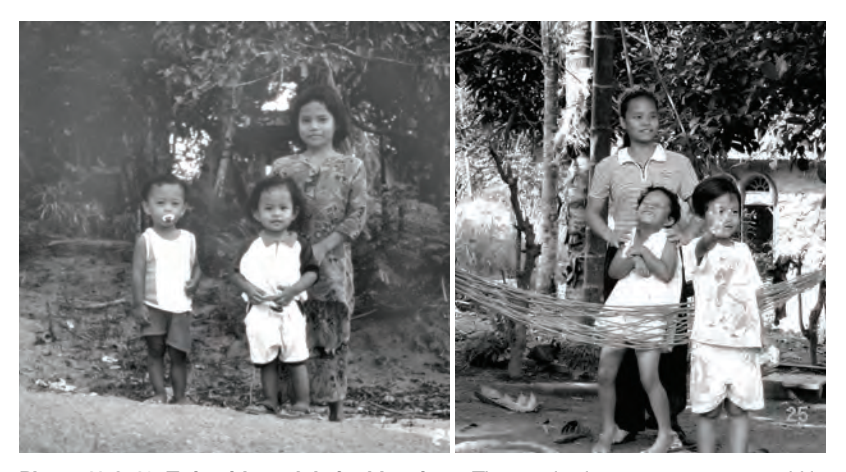
Plates 41 & 42: Twin girls and their elder sister. These twin sisters were two years old in 1998 (Plate 41). In 2008, they will enter lower secondary (middle) school. They have dreams of becoming school teachers. [NT-1998, 2003]

encountered in my outline of the history of the village), can be seen as temporary titleholders who filled the position until the legitimate inheritors grew to maturity. In other words, only those who belong to the same matrilineal descent group as the first Batin, Baning, are regarded as legitimate inheritors to the title. Considering the actual process of the inheritance of titles in Kampung Durian Tawar, however, we can see that not all titles were inherited under matrilineal principles. It is evident that inheritance to titles was manipulated, so to speak, according to the village politics of the time.