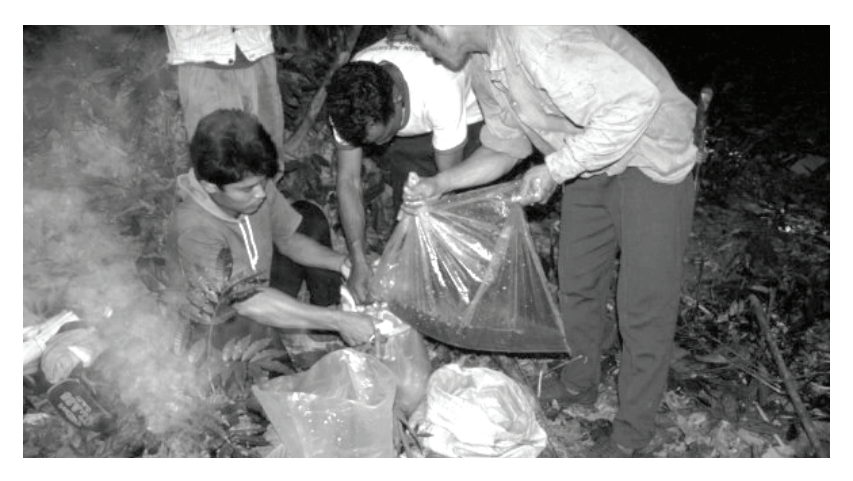
Plate 29: Gathering honey. Gathering honey is very dangerous work because a skilled gatherer has to climb tall trees and drive out a swarm of bees with smoke to get at a honey comb. Most of the honey is sold to the Chinese middleman; the rest is consumed at home. [NT-1998]

restaurants. This is probably because Malays generally eat at home and, as such, it is economically difficult to run a Malay restaurant.