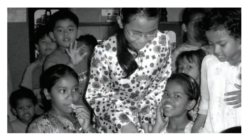
Plate 35: Hari Raya. Hari Kesedaran (or Hari Raya) is a special holiday for villagers of Kampung Durian Tawar. The youths who are working outside return to the village to cerebrate Hari Raya with their families. Children dress up and visit their relative's houses. They eat lemang (glutinous rice steamed in bamboo) and special biscuits. At night, 'disco' dancing is held in the open. The villagers usually look forward to Hari Raya with pleasure.

rubber trader's shop closes for business, so it is not possible to sell rubber. On top of that, all Chinese-operated businesses in the town close, making it difficult to sell things obtained from the forest. Due to the strong reliance of many Orang Asli villagers on Chinese businesses, many hold Hari Raya in February to fit in with Chinese New Year. During Hari Raya relatives come to visit (as is the case with the Malay Hari Raya Puasa), banquets are given and discos ( joget , meaning "dance") with live music are held at night (for religious reasons, discos are no longer held in Malay villages). As local Chinese also come to visit, many other villages provide beer for these events.