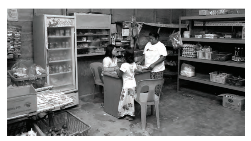
Plate 34: Village general store. In 1998, there was only one general store in Kampung Durian Tawar. Later, one more store opened in the residence area of the lower people. In the evenings, which are pleasantly cool, the village women and children come to the store to buy snacks, biscuits and foodstuffs. The men, however, who have motorbikes and cars, prefer to go to the nearest town (Pertang) for their purchases. [NT-2007]

People stroll about the village and visit each other. This is the time of "emerging" ( nimbul ; in Malay, timbul ). It is not, of course, a fixed activity that occurs every day; people visit others if they feel inclined to do so. The evening meal usually occurs after 8 pm; as such, nimbul lasts until that time.