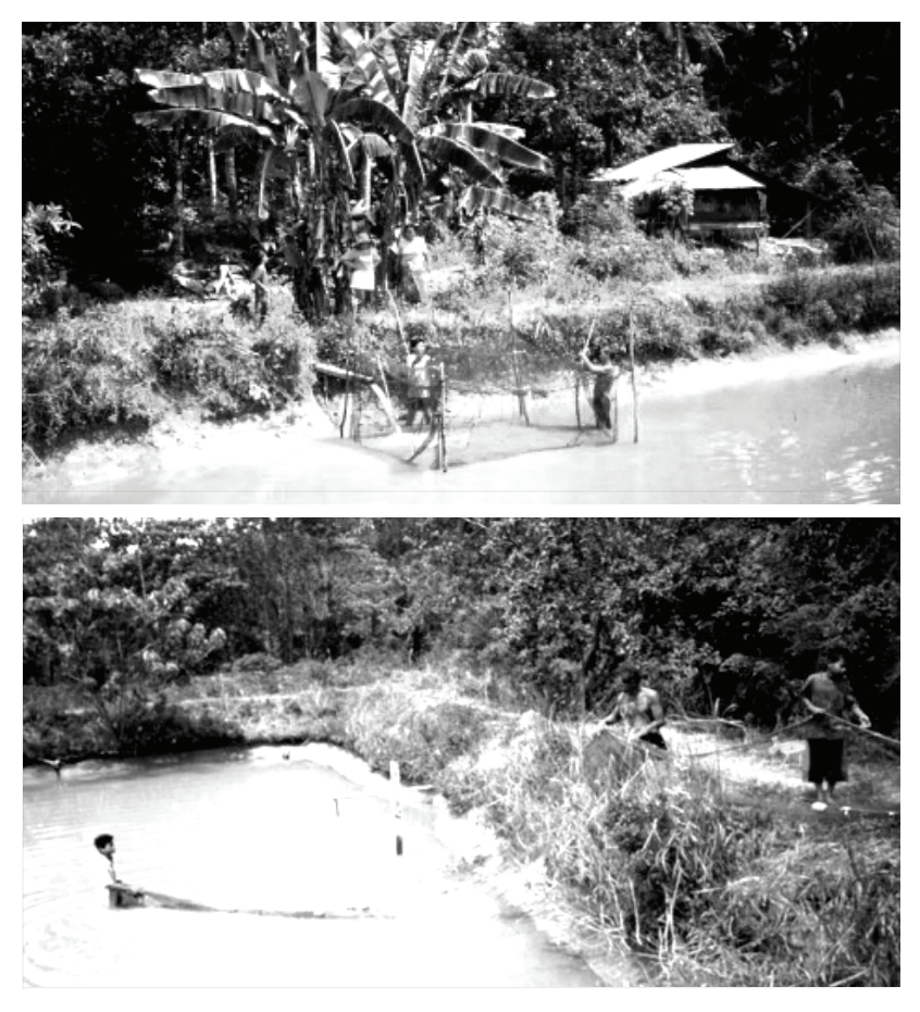
Plates 20 & 21: Fishponds of Ukal and Manyo. Ukal and Manyo owned these fishponds. They used nets to catch the fish which was then sold to the Chinese middleman. In 1998, a joint project between some businessmen and the JHEOA focused on rehabilitating the abandoned fishponds, including that of Ukal and Manyo. The villagers essentially rented out their fishponds for an annual rent of RM300. [NT-1997]

an aid project for the development of goat farming was implemented in 1986. However, this seems to have ended in failure.<sup>10</sup>