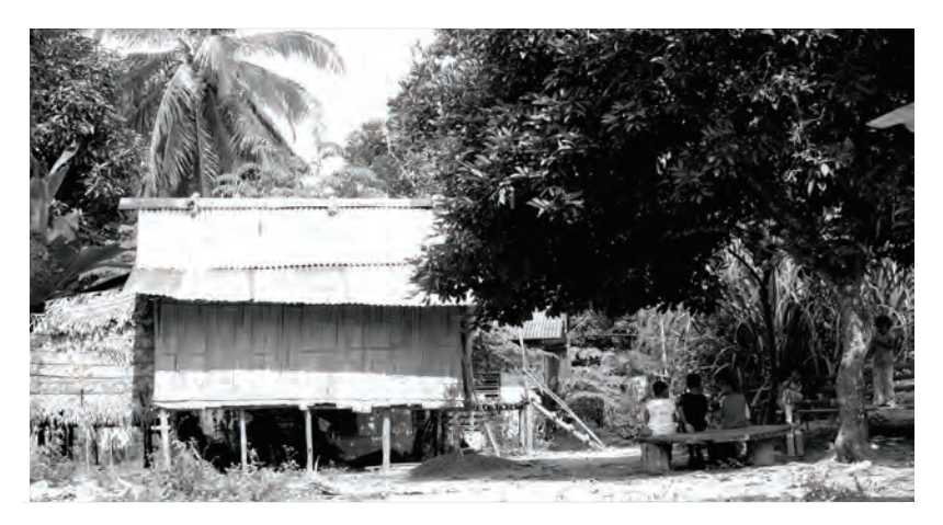
Plate 22: Children are resting in the shade under trees. Trees in the village sometimes provide resting places for villagers in the afternoon when it can get too hot in the house for comfort. In the afternoon, children spend their time resting, playing in the field, or going to the village shop to buy sweets and biscuits. [NT-2007]