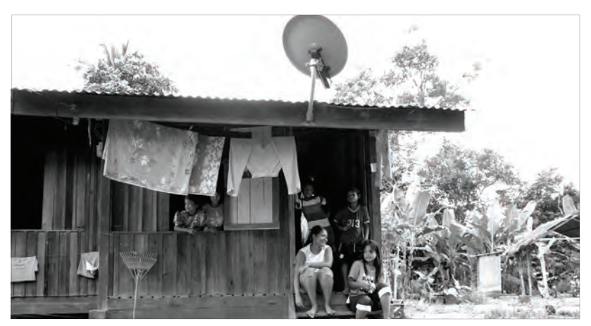
Plate 4: Astro (satellite television). This family put up a satellite antenna early in the 2000s in their 1970s, government-built house. They must pay about 50 ringgit per month in order to access the basic programs which Astro provides. The Astro's picture quality is very superior compared to the often very weak signals from the free-to-air TV channels. [NT-2007]

The gap between our worldviews is only to be expected because we live in different worlds. For urban dwellers, the outer periphery of their world is the village (stretching beyond that point is the forest, the ocean and other parts of the natural world), and the forest belongs to the frontier. In the context of development, the forest presents nothing more than a frontier for the government and industry.<sup>13</sup> For the Orang Asli, however, the forest is their life source, not a development frontier. The invasion by development projects of their living space, the forest, has altered Orang Asli society, and has sometimes led to the destruction of their culture.