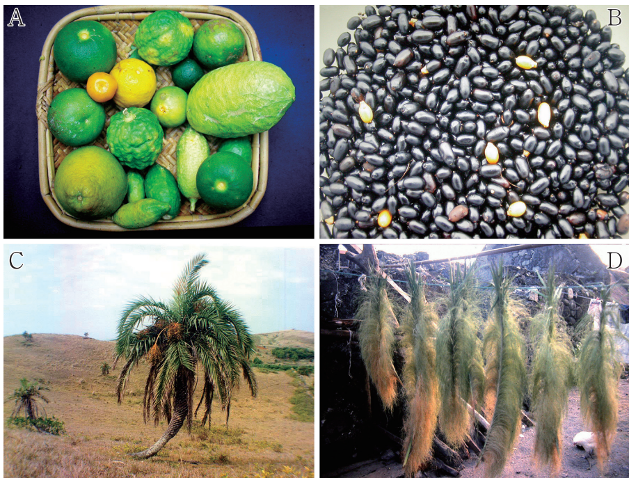
Plate 1 A: Fruit from a range of Citrus species found in Batanes B: The edible fruit of Phoenix loureiroi var. loureiroi (Philippines date palm, voyavoy ) C: Wild example of the palm on Itbayat Island, Batanes D: The leaves drying after shredding of the leaflets