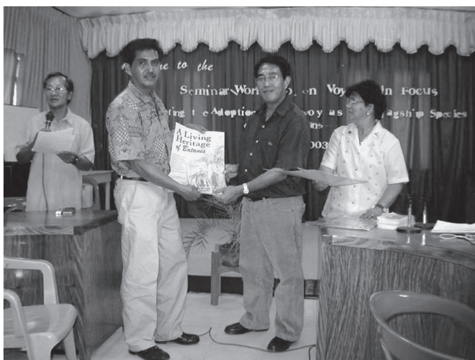
Plate 3 The 2003 workshop on the conservation and preservation of the Philippines date palm ( voyavoy ), held in Batan town.

including several native Citrus species and other Rutaceous plants.