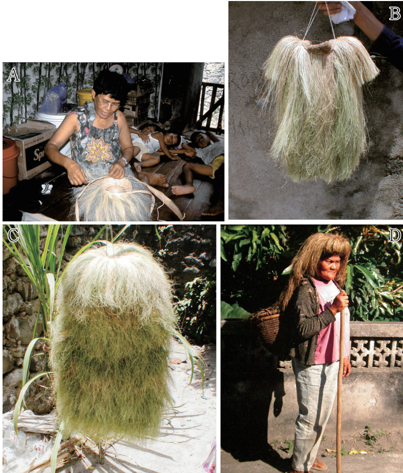
Plate 2 A: Weaving a cape, starting with the hood: here we can see strips of tissue from Musa textilis ( abaca ) being used to wrap the split rachis of voyavoy . B: A completed vest ( kanaye ) C: A completed hood and cape ( vakul or suot ) D: The hood and cape provide all-weather protection for head and shoulders