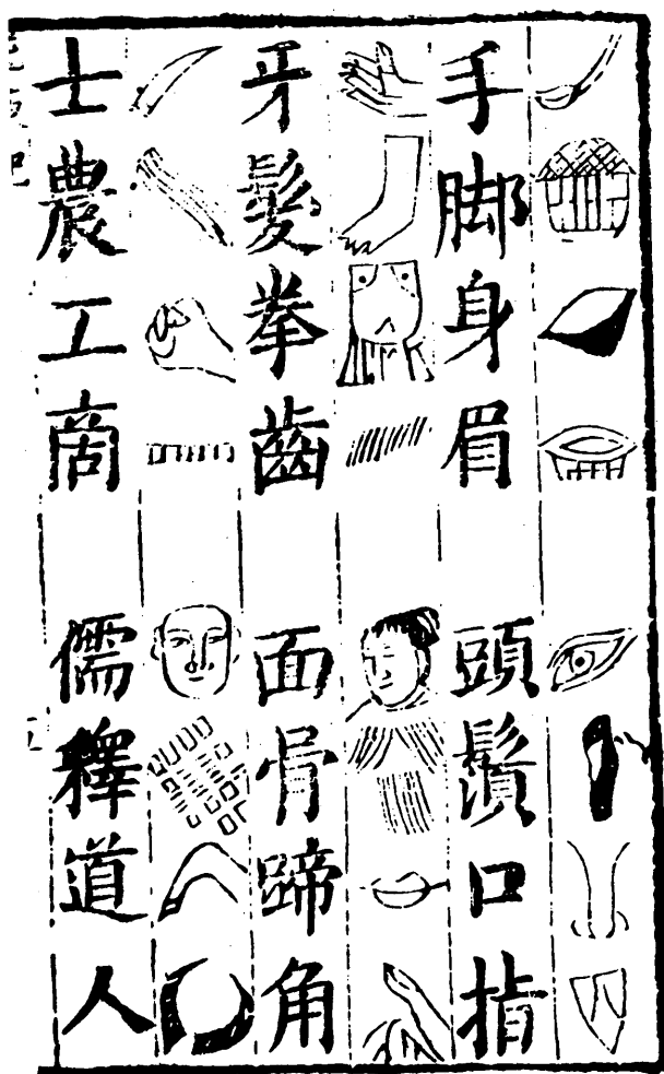
Fig. 2 Dui-xiang si-yan (Illustrated Four-Character Glossary), a kind of "za-zi" (miscellany) [RAWSKI 1979, p. 131, Fig. 2].

In the Qing Dynasty, the kao-zheng (evidential research) scholarship, a kind of philological study of Chinese classics, prevailed among scholars. Manchu scholars active in this field included Na-lan Xing-de, Kui Xu, and few others. The kao-zheng scholarship was dominated by Chinese scholars. The kao-zheng scholarship included phonology to study the rhymes of poems of the Poetry Classic , and to restore the phonological systems of archaic Chinese, and philology to study materials critically. The basis for this phonology and philology was established early in the Qing Dynasty by Gu Yan-wu (1613-1682) with his Yin-xue wu-shu ( Five