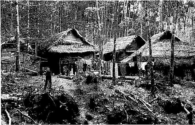
Photo. 2. Semai hamlet with rubber trees in the background.

in terms of time allocation and cash earning potential. In some villages I have come across people selling their game such as feral pig, deer and frogs obtained in their hunting and trapping activities.