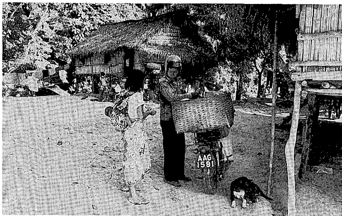
Photo. 1. Semai women buying things from an itinerant trader.

I observed that almost all Tapah Semai villages grow cash crops such as Hevea