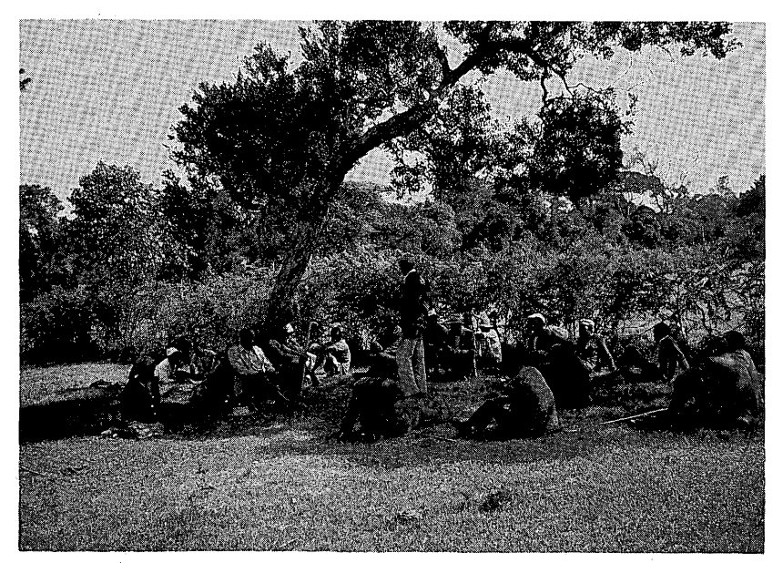
Photo. 1. This is a council of elders discussing a divorce case. The council of elders is a traditional organization which discusses neighborhood family problems and management to pursue better policies. Today, it is attached to the judicial mechanism of kenya as its lowest level. In many cases (especially for civil actions), the magistrate court does not accept the filing of a suit unless accompanied with a certificate of a council of elders trial of the concerned neighborhood.

Besides, or in addition to, this view, there is a theory that the Kipsigis army's defeat in the Mogori War was a direct result of their negligence to carrying out the traditional fortune-telling before going to war. In the Kipsigis tradition, when