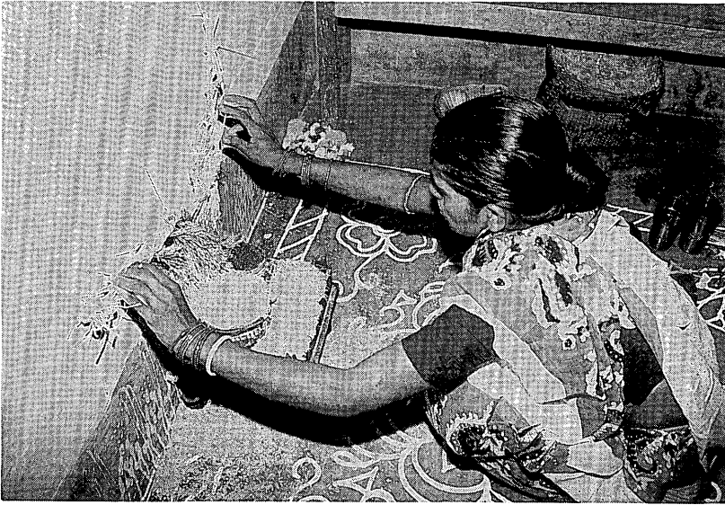
Plate 2. A married woman preparing for māṇa basā worship in her husband's house.

experiences her first menstruation, marriage and pregnancy, the mother earth goes through the same stages. In Orissa, the earth's pregnancy is celebrated on garbhaṇā samkrānti (pregnancy samkrānti ) in the month of Kārttika, and celebration of the birth of its fruits take place during māṇa basā in the harvest season of Mārgaśīra. Mother earth is said to menstruate during the four days of raja parba and all goddesses in the village are said to do so too during the period of this festival. Women, young unmarried girls in particular, look forward to raja parba .