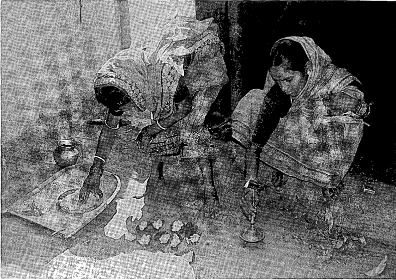
Plate 1. Married women preparing offerings for their husbands' ancestors during śrāddha .

room in the house. Also, small bones left after cremation are placed in an earthen pot and buried in the wall facing the back yard ( śubha ). Every full moon, new moon and saṃkrānti day, married women put a mixture of water, milk, rice and flowers on the iśāna and śubha . The ancestors ( baḍabaḍiā ) are said to take water ( pāṇi pāibā ) in this way and women also offer cooked food they prepare on special occasions such as śrāddha . Feeding the ancestors in this way is the duty of women who have married into the family and is not done by daughters of the line, married or unmarried.