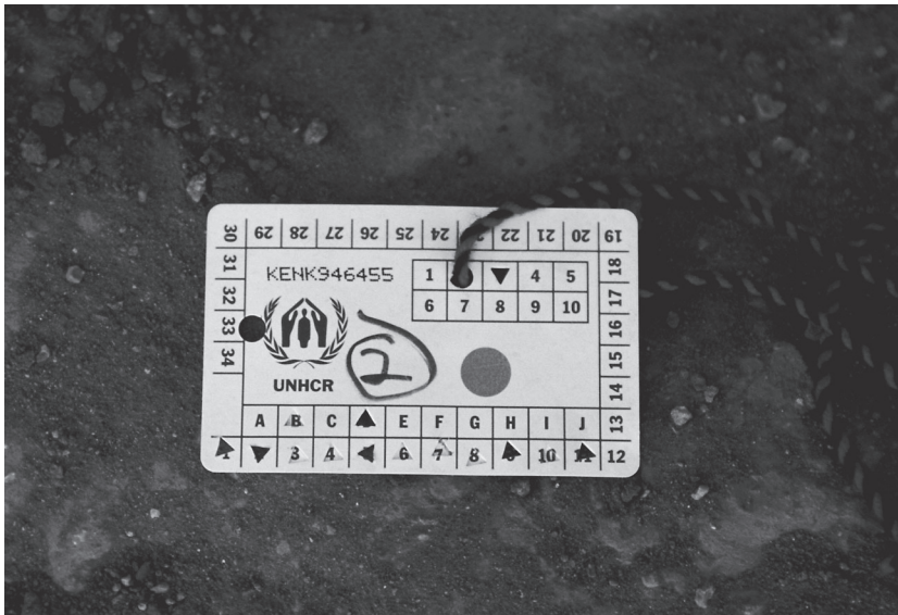
Photo 2 Food Distribution Card (The numbers 1–10 at the upper right shows the number of people entitled to distribution. On this card, the number 3 has been punched.)