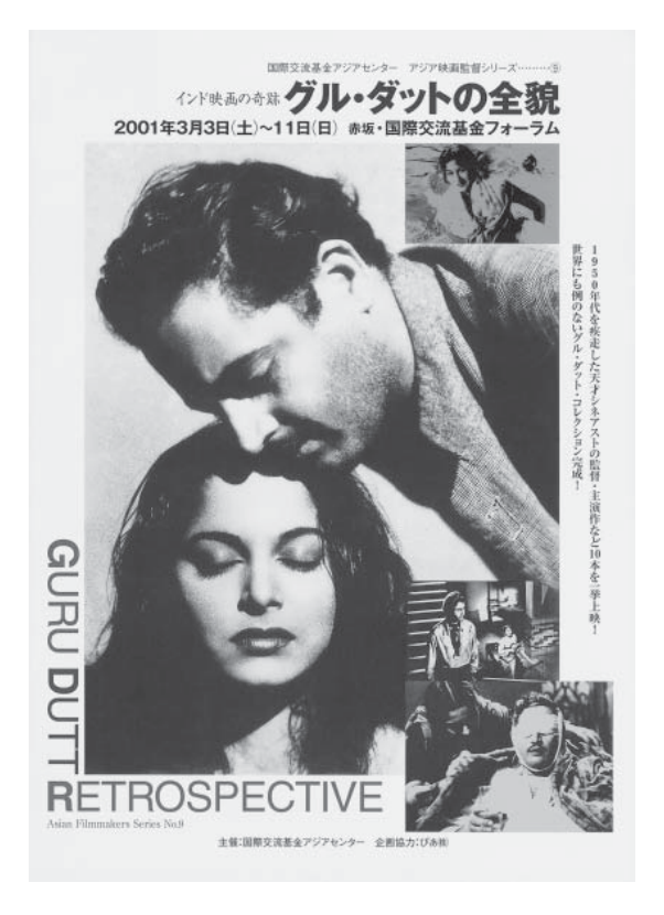
Plate 6 The leaflet of the Guru Dutt Retrospective in 2001

Fortunately, the Japan Foundation (up to 2004 its Asia Center) holds Indian film screenings as part of its film festivals as well as in the form of a retrospective every two or three years. The Japan Foundation shows a wide range of Indian films, albeit not on a commercial basis. In 1998 it organized the Indian Film Festival in Japan 1998. Six films were shown in the series entitled "The History of Indian Popular Cinema after Independence," and six more in "Raj Kapoor and Maniratnam: Two Great Directors." At that time, screenings outside Tokyo were rare. In 2000 and 2001, it held a Guru Dutt