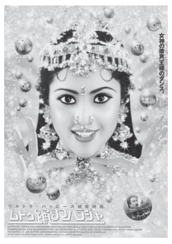
Plate 1 The leaflet of Muthu at 1998 release

In 1998, one Indian film appeared on Japanese screens. The Tamil film Muthu , which was made in Chennai (formerly Madras), the biggest city in south India, was released under the Japanese title Mutu: Odoru Maharaja (Muthu: Dancing Maharaja; Plate 1). The show