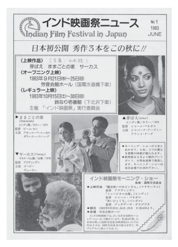
Plate 5 The leaflet of the first Indian Film Festival in Japan in 1983

scenes, such as Awara (The Vagabond, 1951) and Pyaasa (The Thirsty One, 1957), both in Hindi. Those 25 films were shown in all over Japan and attained a fairly good response. However, the result was far from my expectations.