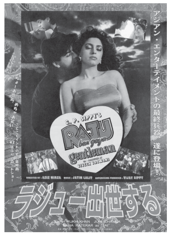
Plate 2 The leaflet of Raju Ban Gaya Gentleman at 1997 release

again, and became interested in Indian cinema.