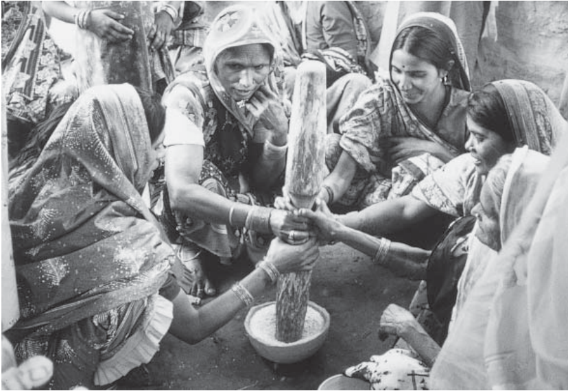
Plate 2 The kūṇā (five married women pounding rice of pestle, who prepare meals for ancestors)

These people who died by fire, These who drowned in water, These who died from cobra bite, These who died from a scorpion sting, Today, all of you, we invite to our marriage ceremony.