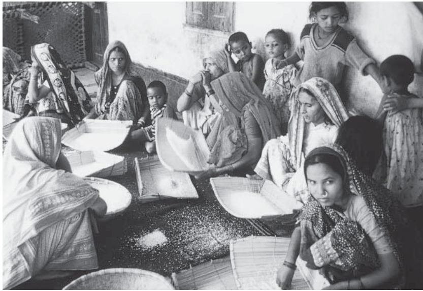
Plate 1 The urd cāval chānnā (female relatives and neighbours sift urd beans and rice by winnowing baskets with singing songs)

On the fourth day, women perform a rite called urd kā dhoīyā dhonā . They wash and peel black urd beans, and make cakes by kneading these with white urd as they sing. These rituals symbolize warding off evil spirits for a successful marriage. During the marriage ceremony, the bride and a bridegroom are believed to be susceptible to evil spirits that can easily take possession of them because they are so charming at this point in their lives.