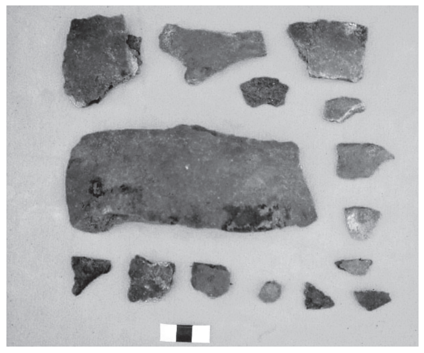
Figure 5 Undecorated pottery of hunter-gatherer origin from a pit in the GAP Layer at Sehonghong Shelter. A radiocarbon determination on charcoal from this feature suggests it is of ninth-century AD age.

the Maloti-Drakensberg region is a single decorated sherd of Msuluzi/Ndondonwane type from my own excavations at Likoaeng, an open-air campsite on the banks of the Senqu River: multiple radiocarbon determinations fit the typology of the sherd in question to suggest a date for its presence there of between the mid-eighth and mid-ninth centuries AD (Mitchell et al. 2008). From the second millennium AD, undecorated sherds from Mhlwazini Cave in the Drakensberg escarpment are probably of Nguni origin (Mazel 1990), while a sherd belonging to the Moloko tradition of South Africa's Sotho-speakers comes from Pitsaneng and is directly dated by OSL to the late sixteenth century (Hobart 2004). Whether we are looking here at the introduction of isolated sherds (valued for their exotic – shamanistic? – connotations; cf. Kinahan 1991), the use of broken pieces of pottery reused as plates or other items, or the acquisition of whole pots is uncertain. Different implications for the social context of the use of these ceramics by hunter-gatherers and for the mechanisms by which they were obtained follow from these various possibilities.