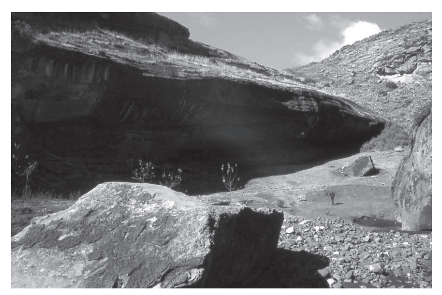
Figure 3 Schonghong shelter, Lesotho. This was one of three sites at which Qing provided an explanation of paintings to Orpen (1874) and was occupied by Bushmen both before and after this visit by Orpen. Note the human figure in the foreground which provides a scale for this massive rock-shelter.