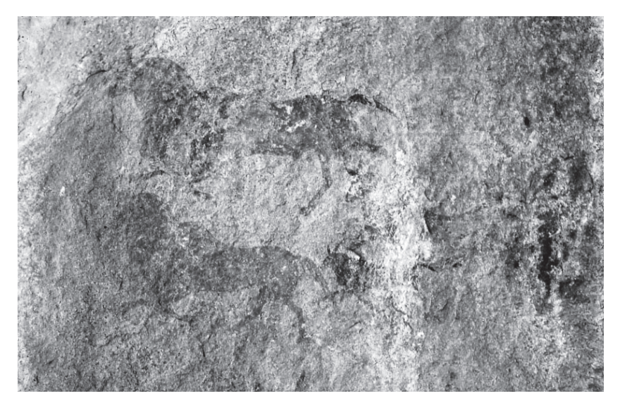
Figure 7 Conflated horse/eland creatures painted in the mid-nineteenth century on the wall of Melikane shelter, Lesotho, one of the three sites at which Qing provided an explanation of painted scenes to Orpen (1874).

years ago (Mazel and Watchman 2003). Furthermore, it is apparent that some of the stylistic sequences previously proposed can be supported by these dates and by detailed studies of superpositioning (Russell 2000). What is of particular interest from these studies is the evidence for change in content that is now emerging. In particular, eland seem to be absent from the earliest surviving phase in the KwaZulu-Natal Drakensberg escarpment, therianthropes may appear only after eland, and rhebuck are restricted to the middle and later parts of the sequence, a conclusion independently supported by a recent assessment of that animal's significance in the region's rock art (Challis 2005). As Swart (2004: 31) writes when summarising these results, "these introductions of different subject matter more likely indicate varying emphases in the hunter-gatherer belief system over time". What was recorded in the late nineteenth century, in other words, is the end product of a long history, and not all of its specific features may therefore be transposable backward in time.