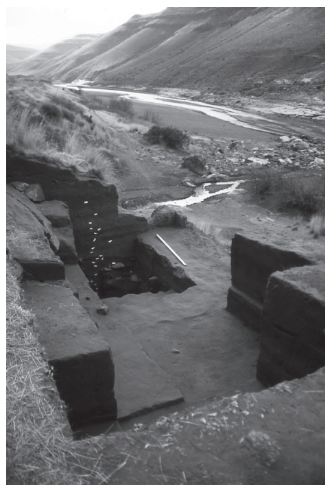
Figure 6 Likoaeng at the end of the 1998 excavation season, looking north along the Senqu Valley. Layer I is the uppermost dark horizon visible in the section to the rear.

Only at one Maloti-Drakensberg region has AMS dating yet been applied to domestic livestock remains. At Likoaeng (Figure 6), sheep and cattle were both identified in the faunal assemblage from Layer I, the same layer that produced the ceramics and iron already discussed (Mitchell et al. 2008). Specimens of both species were submitted for AMS dating via the Pretoria and Groningen radiocarbon laboratories. The sheep sample yielded a determination of 1285 \pm 40 BP (Gra-23237), most likely calibrating to the mid-eighth to mid-ninth centuries AD. This wholly unexpected result fits almost exactly the two other radiocarbon determinations from the same layer, and the likely age of the Msuluzi/Ndondonwane sherd already mentioned. It provides compelling evidence for the presence of sheep in the Lesotho highlands over a millennium before the local establishment of the first Sotho farming villages, but there is more. Although the cattle sample submitted did not have enough collagen to make dating possible (S. Woodborne, Quaternary Dating Unit, Pretoria, pers. comm.), there can be little doubt that the few cattle bones from the site are of the same age as the sheep. The only alternative involves postulating the discard at the same physical location of a few cattle remains that somehow ended up over 50 cm below the surface in an otherwise much older archaeological context that showed no sign of subsequent disturbance. Moreover,