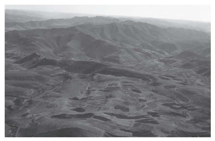
Figure 2 The Maloti mountains of eastern Lesotho.