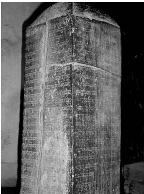
Fig. 3 Khmer inscription from the end of the twelfth century (Vat Ho Phra Kaeo Museum, Vientiane)