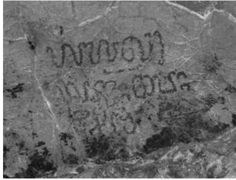
Fig. 4 Tham Nang An inscription in Luang Prabang province

From a palaeographic point of view, the Fak Kham script can surely be considered the prototype for Lao script 28) . It is, however, interesting to remark that the earliest examples of the latter are already noticeably different to their model. For instance, the inscribed stele of Tha Khaek, dated 1494, attests not only to the extensive geographical influence of the Lan Na culture 29) , but also and above all to the independent development of the Lao script