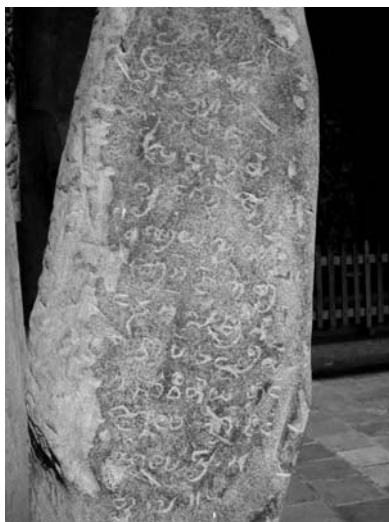
Fig. 2 Mon inscription dated approximately to the eighth century (Vat Ho Phra Kaeo Museum, Vientiane)