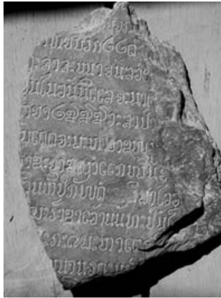
Fig. 5 Fak Kham script in Muang Sing (Northern Laos), 1569