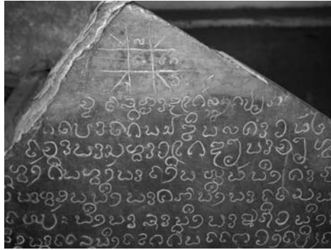
Fig. 6 Lao script of a Luang Prabang inscription (Museum of the Royal Palace), 1530

at this time. The astonishing graphic type of an inscription from Luang Prabang, dated to 1530, may moreover bear witness to a radical intention to deviate from the northern Thai model. It presents, in any case, an example of deliberate stylisation (Fig. 6).