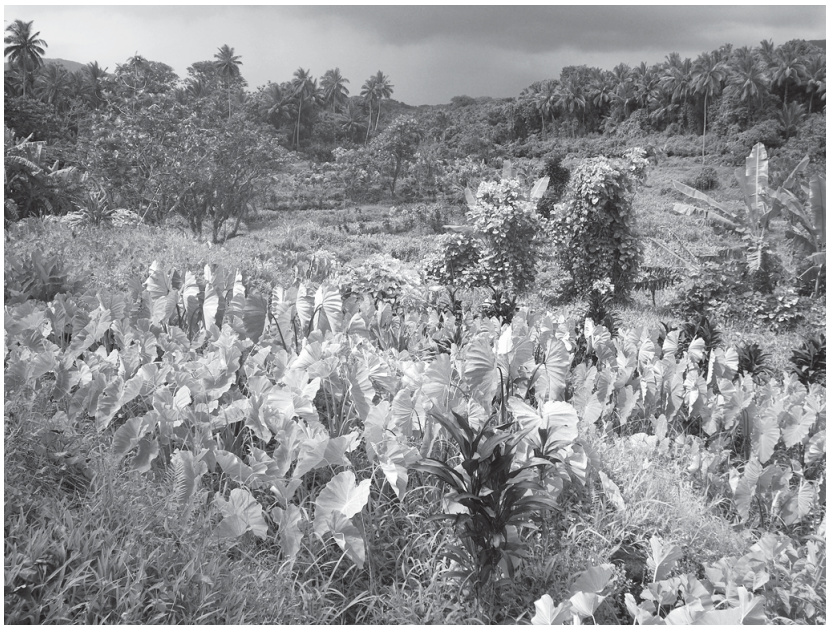
Figure 1 The taro water-gardens named Rotluō cultivated by the inhabitants of Vētuboso, Vanua Lava

In its place, taro is ‘king,’ to paraphrase Bonnemaïson’s (1991) title, since it is the guardian of a wealth of knowledge, in ways possibly unique to Vanuatu and the Pacific. His place of cultivation is named rot , or taro water-gardens (Fig. 1). They have to be managed with water canals that irrigate pondfields structured in terraces. Other systems of taro cultivation, in rivers and swamps, can coexist (but not rainfed agriculture). These taro water-gardens ( rot ) are perceived by the inhabitants of Vanua Lava as a heritage derived from the ancestors because of the particularities of their history and geography. Their units of space