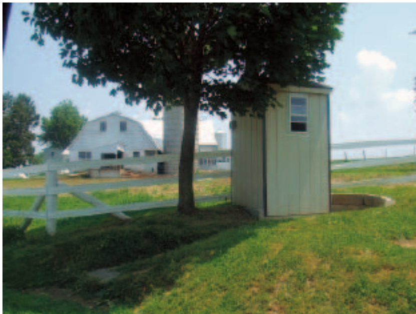
Picture 9 A telephone booth located in the outskirts of a farmstead for use in an emergency by several families, Lancaster, U.S.A., 2007

The practice of face-to-face relationships is not only carried out by people of Old