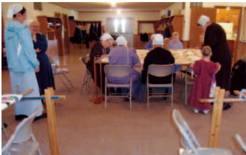
Picture 12 Amish Women doing patchwork, York, Indiana, 2009