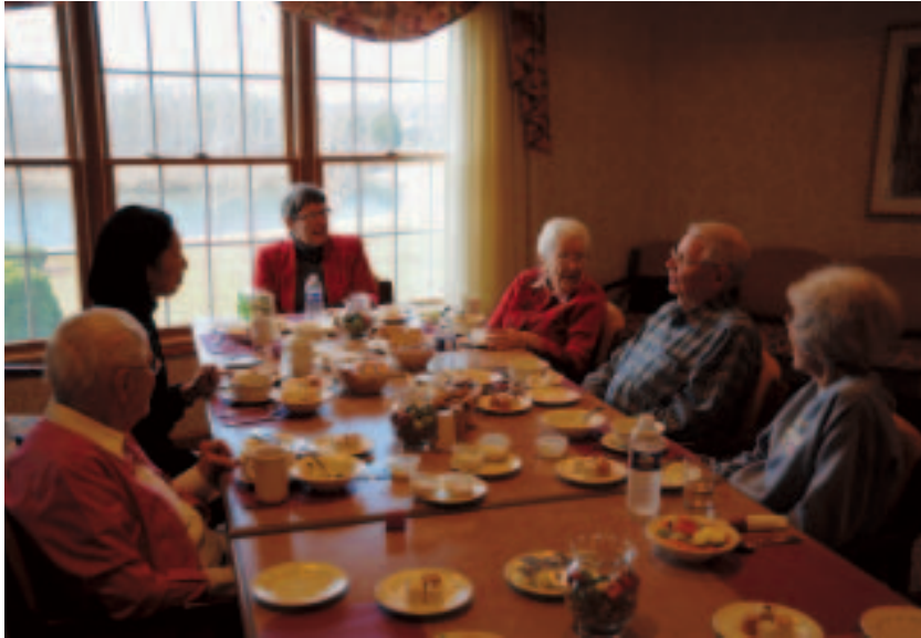
Picture 10 Residents eating lunch together and discussing about what they would like to have for their life care community, Goshen, Indiana, 2010

Assisted living housing for the elderly in Goshen, Indiana, developed through the efforts of the Mennonite people has one of the characteristic features of residential institutions for the aged in United States. It is a complex composed of various kinds of facilities located in one area and is often called a “life care community,” which is so common these days. The elderly can select one of the housing options and receive support based on the condition of their physical ability.