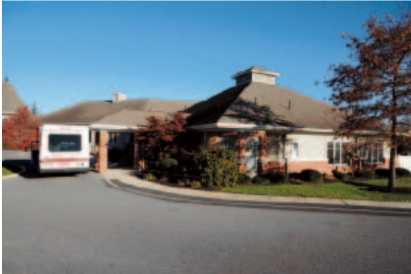
Picture 20 A life care community developing various facilities including a living space for Alzheimer’s patients and “Children’s Learning Centre” for children. Lititz, Pennsylvania, 2010