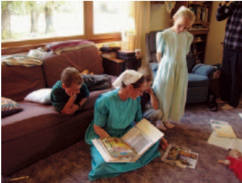
Picture 4 An Amish Mennonite family home-schooling session after their morning chores, Hutchinson, Kansas, 2009

In 1877, the Amish Mennonites separated from Old Order Amish and constructed their meeting houses for worship calling them “meeting house Amish.” These days they choose what they want to wear, their occupations, and their form of education from a variety of possibilities. Some work on farms and home-school their children, and others choose to go to college and to work in a city.