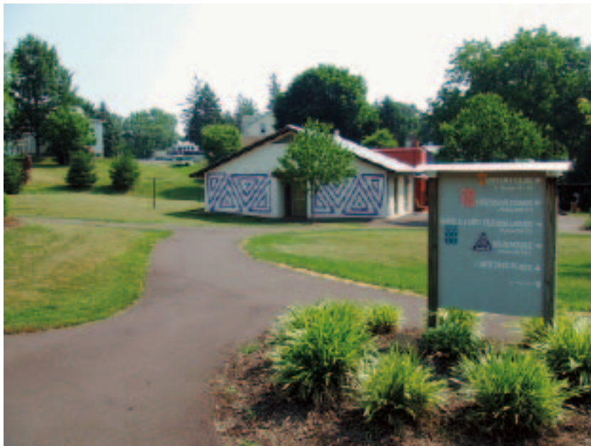
Picture 14 Temporary housing for training people from abroad and those going abroad, Mennonite Central Committee, Akron, Pennsylvania, 2007

A patchwork quilt is exhibited in the plaza of the MCC facility in Akron. It was made in collaboration with people who came from various parts of the world, and this quilt expresses a cultural unity different from a feature pattern and the colors of Amish