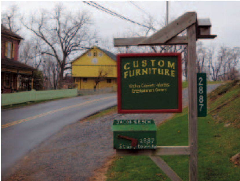
Picture 7 “Furniture” Shop run by Old Order Amish selling wood-working, Pennsylvania, 2008

Even in that case, they have tried to develop new types of work such as selling farm products in a shop installed in the corner of the farm, opening a restaurant to serve typical Amish cooking (Suzuki 2003d; 2008a), and producing and selling traditional Amish furniture. For Old Order Amish, who as part of their philosophy will not evangelize, leading an everyday life consists of thoughtful practices and is a way to fully express their beliefs.