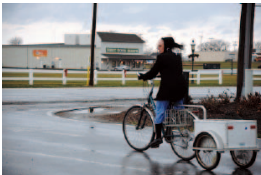
Picture 2 An Old Order woman riding a bicycle, Indiana, 2010