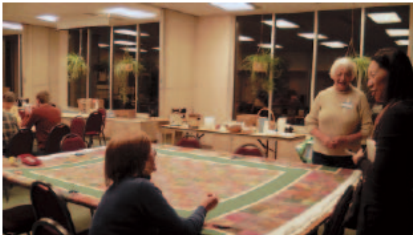
Picture 11 Mennonite volunteers making a comforter by quilting patchwork cloth in the meeting room of a church set up on the premises of a college, Goshen, Indiana, 2010

People of various Anabaptist groups are ardently offering the articles and the labor for these auctions. Earnings mounted up to 4.8 million dollars in a year when forty-one auctions were held. Old Order groups, such as the Amish, are also participating by helping through Christian Aid Ministries (CAM), Mennonite Central Committee (MCC), and Mennonite Disaster Service (MDS). The vast majority that support CAM are conservative groups such as Old Order Amish and the Amish Mennonites. CAM delivers 130 million yen a year in monetary aid from contributions and auctions.