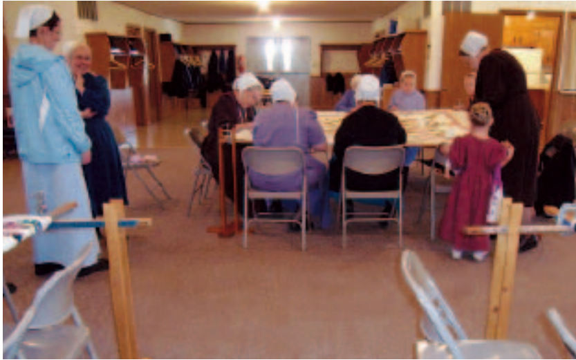
Picture 12 Amish Women doing patchwork, York, Indiana, 2009