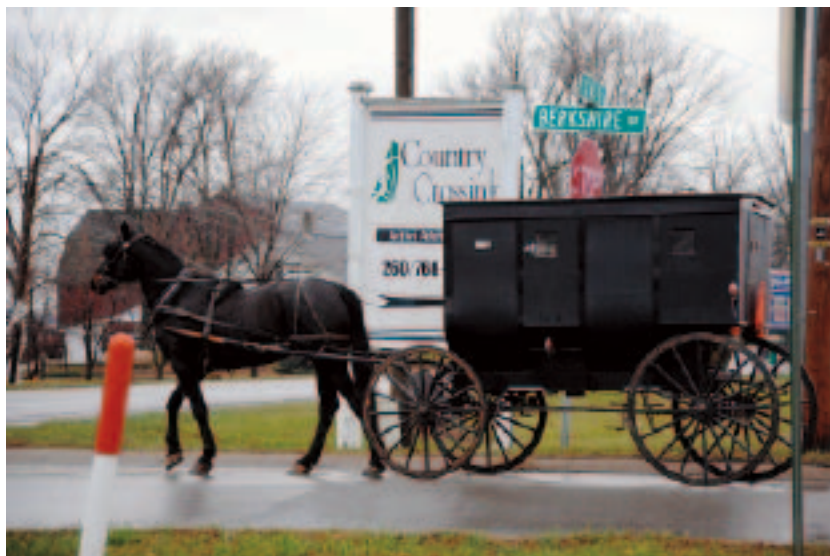
Picture 1 Horse and buggy going on a country road, Indiana, 2010