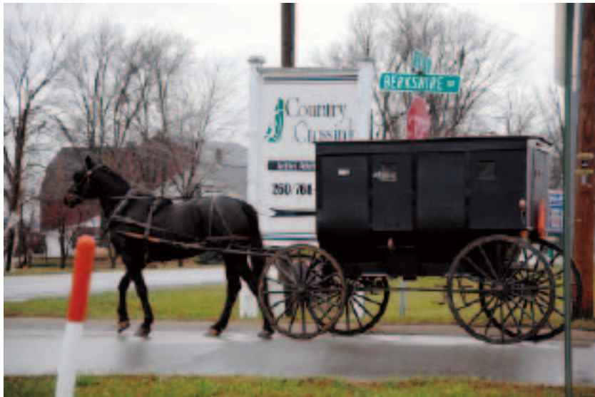
Picture 1 Horse and buggy going on a country road, Indiana, 2010