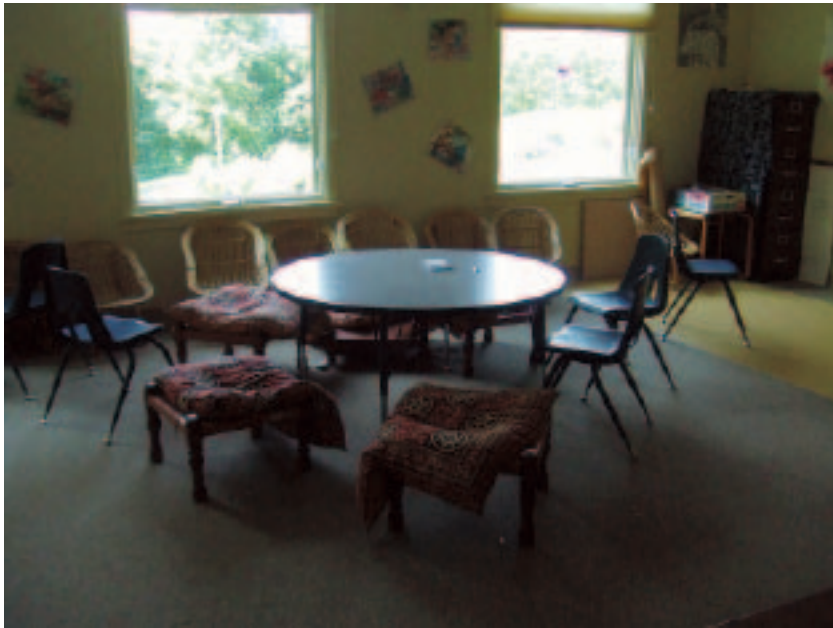
Picture 15 A conference room for children with small chairs for children installed at the largest Mennonite Central Committee (MCC) in North America, Akron, Pennsylvania, 2007