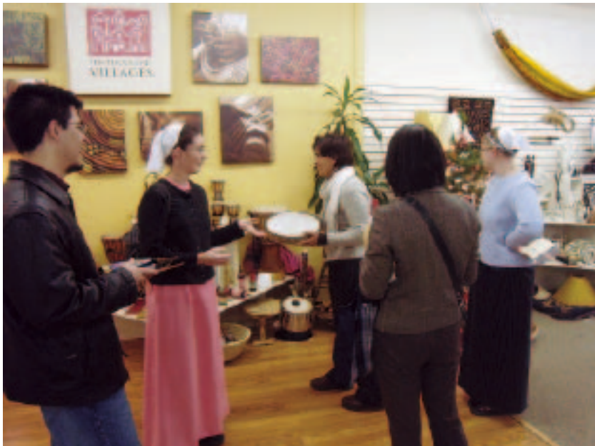
Picture 18 A Mennonite director, the center, of the Ten Thousand Villages came from Egypt to explain the products to Amish Mennonites, Hutchinson, Kansas, 2009