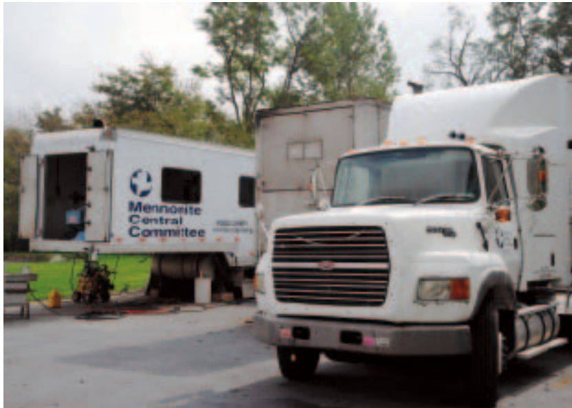
Picture 13 A truck for canning, Akron, Pennsylvania, 2011

where Anabaptist churches are active are anxiously waiting for the truck for “canning,” coming all the way from Pennsylvania. The truck with equipment goes around the United States for people to volunteer to can, and the canned goods produced will be sent to an area where people need good food. This kind of event consists of a sale and canning; it is one of the big events and open to the general public.