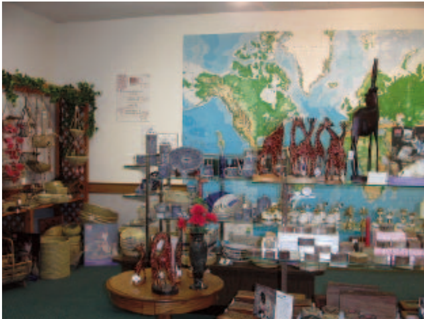
Picture 17 Ten Thousand Villages with a map of the world, Berlin, Ohio, 2004