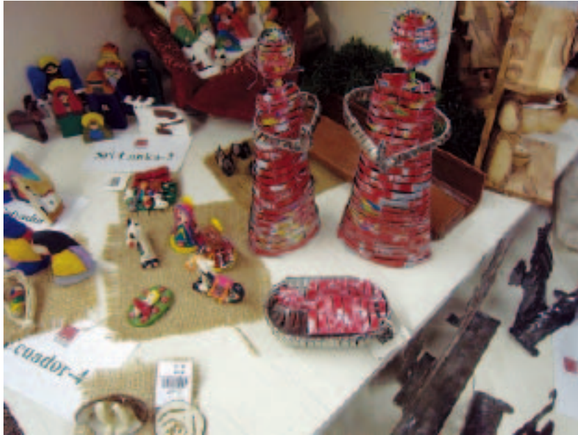
Picture 19 Products made from recycled materials, Hutchinson, Kansas, 2009

produced by a woman who escaped domestic violence and is trying to become independent.