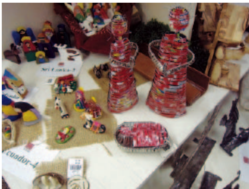
Picture 19 Products made from recycled materials, Hutchinson, Kansas, 2009

produced by a woman who escaped domestic violence and is trying to become independent.