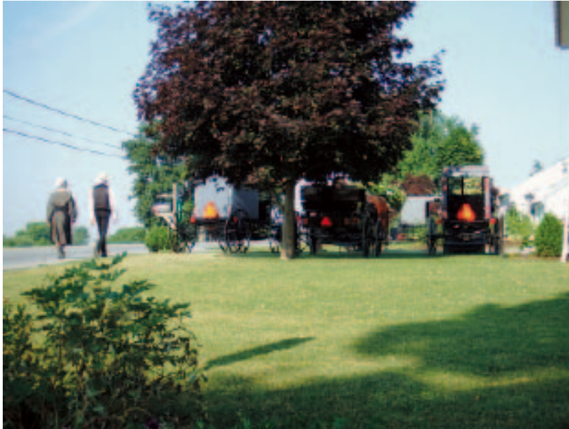
Picture 3 Old Order people gathering to worship at one of the member's houses by their buggies, Lancaster, Pennsylvania, 2007

Children go to school until they reach the eighth grade (Suzuki 2003c).