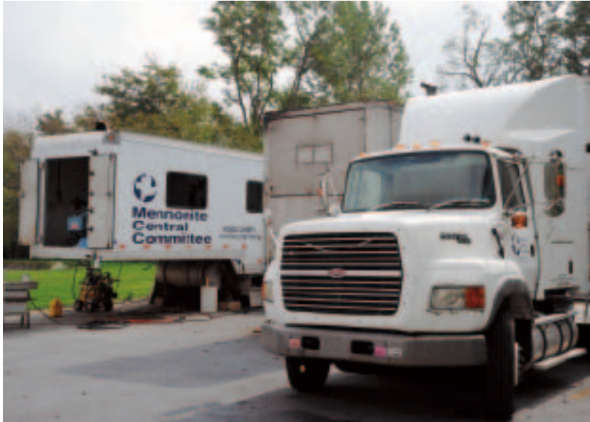
Picture 13 A truck for canning, Akron, Pennsylvania, 2011

where Anabaptist churches are active are anxiously waiting for the truck for “canning,” coming all the way from Pennsylvania. The truck with equipment goes around the United States for people to volunteer to can, and the canned goods produced will be sent to an area where people need good food. This kind of event consists of a sale and canning; it is one of the big events and open to the general public.