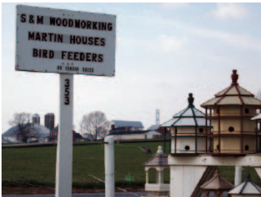
Picture 6 Woodworking Shop run by Old Order Amish selling bird feeders, Indiana, 2010