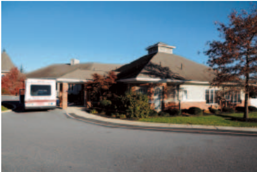
Picture 20 A life care community developing various facilities including a living space for Alzheimer's patients and "Children's Learning Centre" for children. Lititz, Pennsylvania, 2010