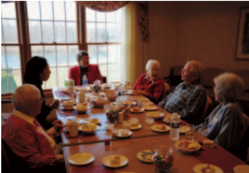
Picture 10 Residents eating lunch together and discussing about what they would like to have for their life care community, Goshen, Indiana, 2010

Assisted living housing for the elderly in Goshen, Indiana, developed through the efforts of the Mennonite people has one of the characteristic features of residential institutions for the aged in United States. It is a complex composed of various kinds of facilities located in one area and is often called a “life care community,” which is so common these days. The elderly can select one of the housing options and receive support based on the condition of their physical ability.