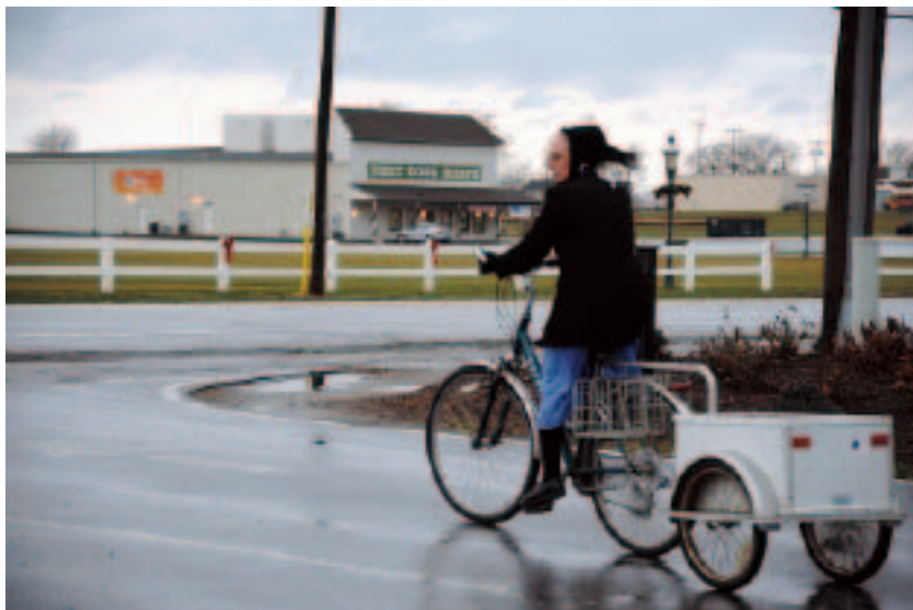
Picture 2 An Old Order woman riding a bicycle, Indiana, 2010