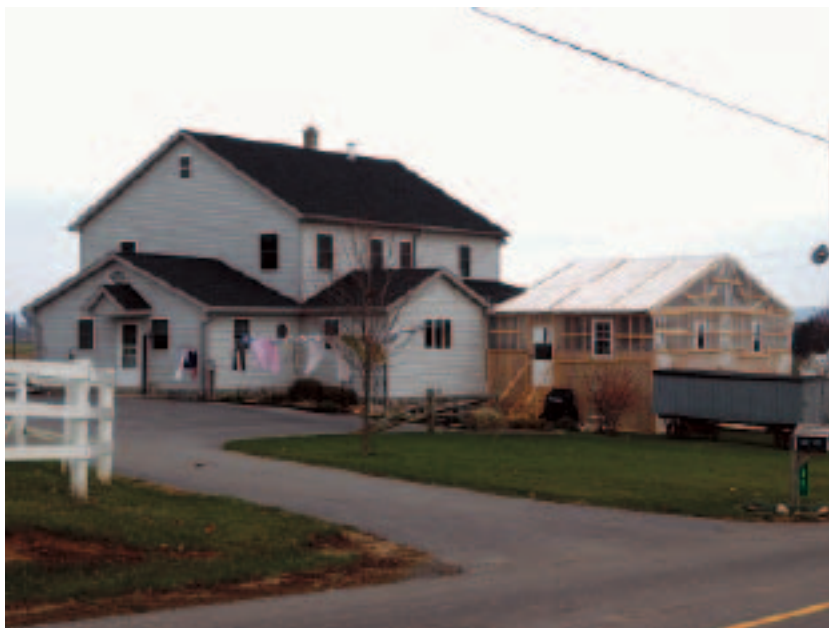
Picture 8 “Gross daadi” Haus (“the house of big father”) under construction in Lancaster, U.S.A. 2008

common for people not to take curative treatments even for senior citizens who have become weak. This practice is based on a common understanding of how to spend human life stages.