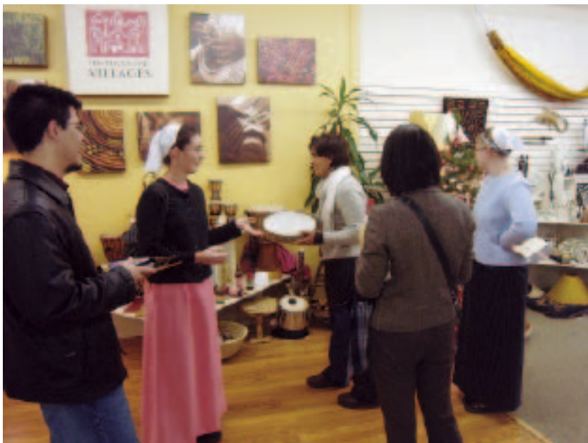
Picture 18 A Mennonite director, the center, of the Ten Thousand Villages came from Egypt to explain the products to Amish Mennonites, Hutchinson, Kansas, 2009