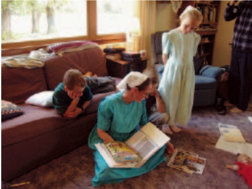
Picture 4 An Amish Mennonite family home-schooling session after their morning chores, Hutchinson, Kansas, 2009

In 1877, the Amish Mennonites separated from Old Order Amish and constructed their meeting houses for worship calling them “meeting house Amish.” These days they choose what they want to wear, their occupations, and their form of education from a variety of possibilities. Some work on farms and home-school their children, and others choose to go to college and to work in a city.