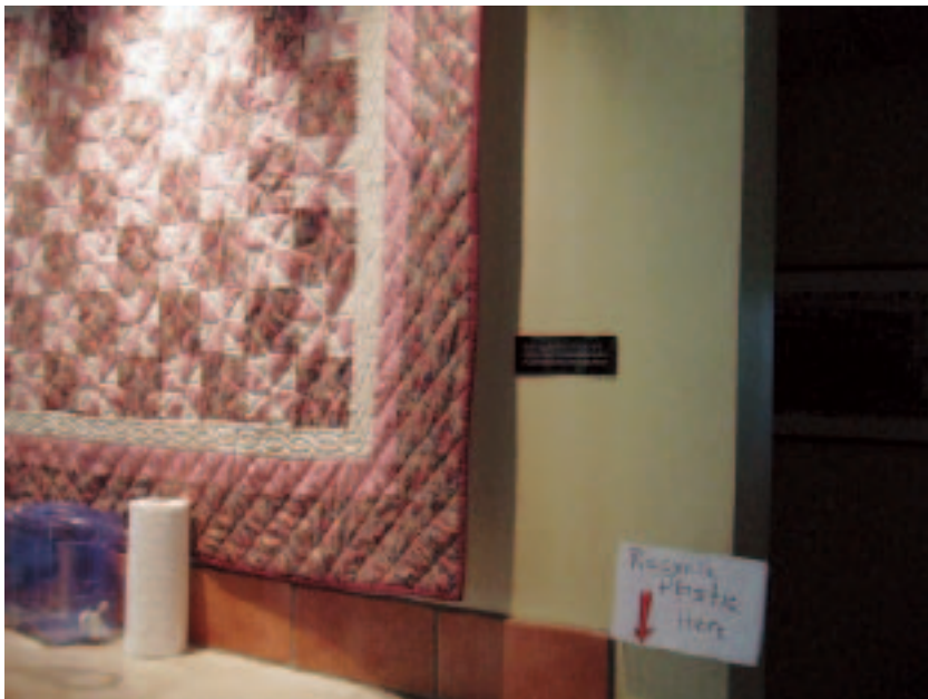
Picture 16 A quilt hangs at the largest Mennonite Central Committee (MCC) in North America, Akron, Pennsylvania, 2008