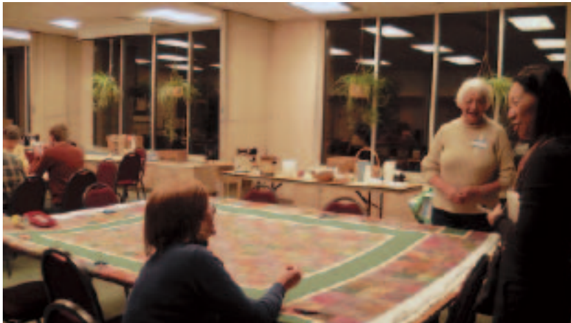
Picture 11 Mennonite volunteers making a comforter by quilting patchwork cloth in the meeting room of a church set up on the premises of a college, Goshen, Indiana, 2010

People of various Anabaptist groups are ardently offering the articles and the labor for these auctions. Earnings mounted up to 4.8 million dollars in a year when forty-one auctions were held. Old Order groups, such as the Amish, are also participating by helping through Christian Aid Ministries (CAM), Mennonite Central Committee (MCC), and Mennonite Disaster Service (MDS). The vast majority that support CAM are conservative groups such as Old Order Amish and the Amish Mennonites. CAM delivers 130 million yen a year in monetary aid from contributions and auctions.