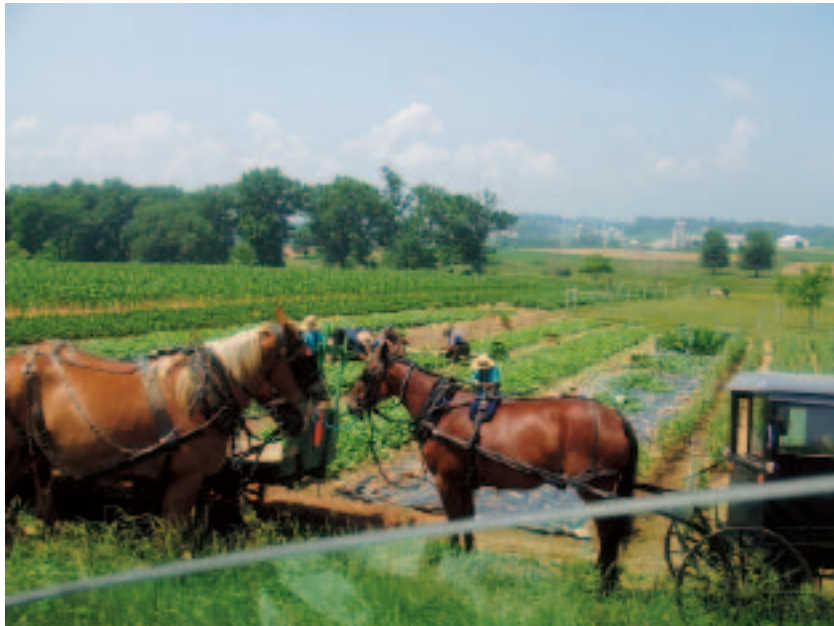
Picture 5 Old Order Amish working in the field without using agricultural machines, Lancaster, Pennsylvania, 2007