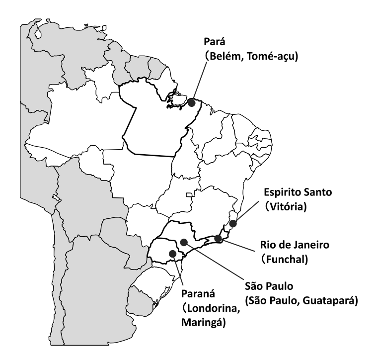
Map 1 Fieldwork Setting