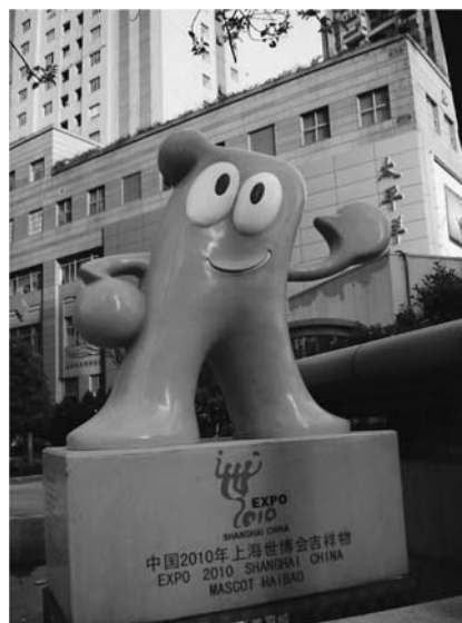
Photo 2 Haibao, the Expo's Mascot Doll