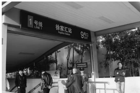
Photo 14 A Subway Station