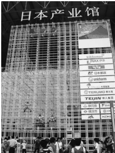
Photo 10 Japan Industry Pavilion

The Puxi section placed “actors” of enterprises and cities at the core. If we regard the nations and international organizations of the Pudong section as the main actors of the present age, Puxi’s enterprises and cities can be regarded as leading forces in the future. In addition, we need to discover what intention lay behind the allocation of zones. Of course, the sections cannot be classified simply as “present-oriented” or “future-oriented.” It is unlikely that one outstanding planner conceptualized and designed everything at the Shanghai Expo. It seems rather that the Expo was designed by consensus among many people at universities and in public office. It would be an interesting research project to clarify the sequence of events that led to the classification of the zones.