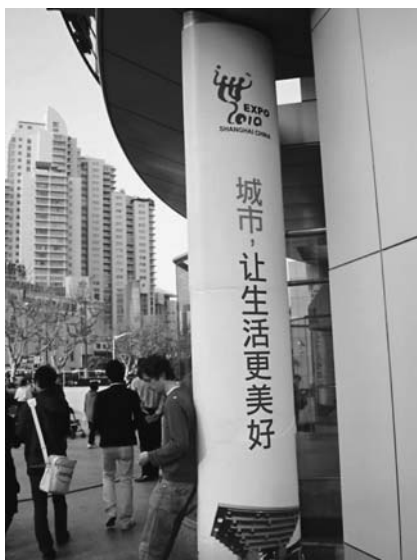
Photo 1 The Main Theme of the Expo

The Expo's theme appeared everywhere on the streets of Shanghai (photo 1), along with Haibao ("sea treasure" in Chinese), the Expo's mascot doll (photo 2). Various slogans were also presented: "世界文明的盛会 我们大家的世博 (Prosperous Event of World Civilization: World Expo for All of Us)" (photo 3) and "精彩世博 文明先行 (Wonderful World Expo, Manners First)" were the ones I came across most often. The Chinese word "文明 ( wenming )" has two meanings: "civilization" and "good manners," with the latter more commonly used. The motto of "和谐的城市 谦让的我 (Harmonious City, Modest Self)" was also prominent and suggested that the city wished to take this opportunity to improve its situation – something