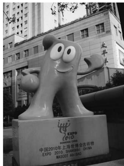
Photo 2 Haibao, the Expo's Mascot Doll