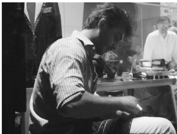
Photo 16 Dressmaker at the Italy Pavilion