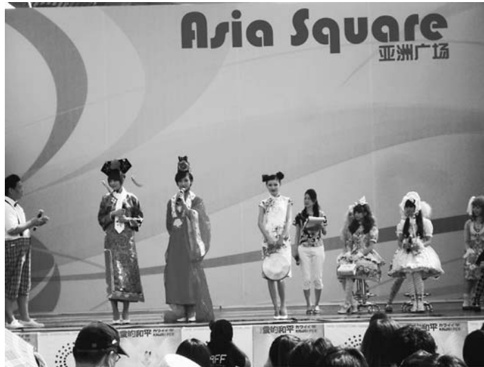
Photo 19 Chinese and Japanese Lolita Fashion

Japanese government with anime songs in Lolita fashion, were most attractive to young Chinese (photo 19). There was also a light portable shrine with lanterns featuring anime characters, newly built in Washimiya Shrine in Saitama Prefecture, which is famous as a sacred place for “ Otaku ” anime fans. Thus (photo 20) I happened to encounter a new Japanese sacred place expanding abroad with the help of its government.