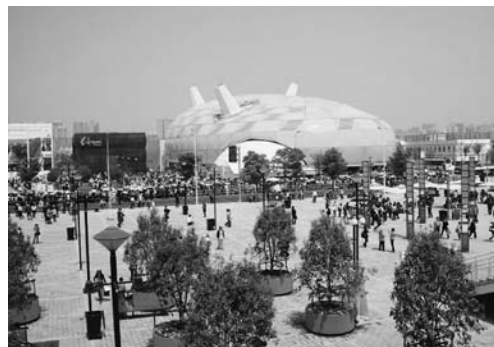
Photo 9 Japan Pavilion