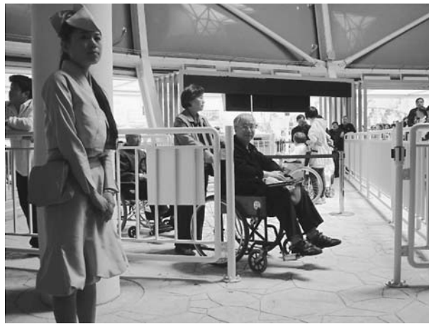
Photo 17 Japanese Attendant