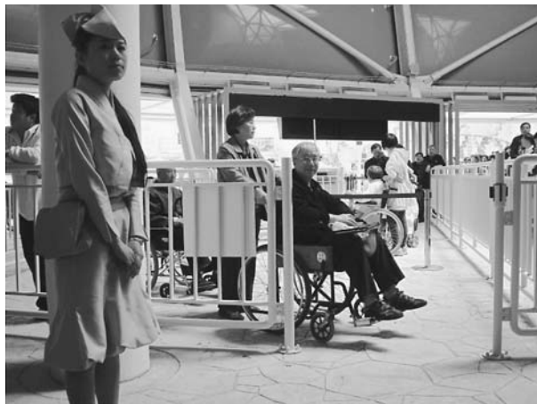
Photo 17 Japanese Attendant