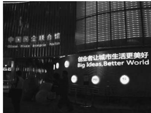
Photo 11 Pavilion of Chinese Private Enterprises