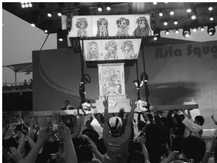
Photo 20 Portable Manga Palanquin of Washimiya Shrine