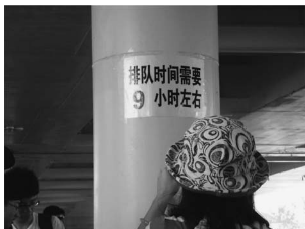
Photo 15 Nine Hours of Waiting