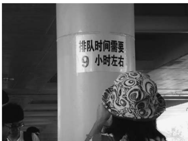
Photo 15 Nine Hours of Waiting