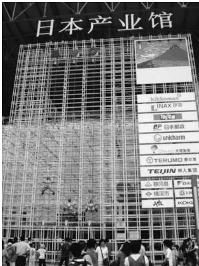
Photo 10 Japan Industry Pavilion

The Puxi section placed “actors” of enterprises and cities at the core. If we regard the nations and international organizations of the Pudong section as the main actors of the present age, Puxi’s enterprises and cities can be regarded as leading forces in the future. In addition, we need to discover what intention lay behind the allocation of zones. Of course, the sections cannot be classified simply as “present-oriented” or “future-oriented.” It is unlikely that one outstanding planner conceptualized and designed everything at the Shanghai Expo. It seems rather that the Expo was designed by consensus among many people at universities and in public office. It would be an interesting research project to clarify the sequence of events that led to the classification of the zones.