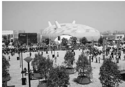
Photo 9 Japan Pavilion