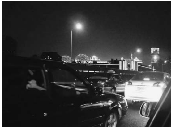
Photo13 Sacred Place from Afar