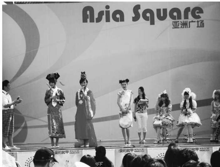
Photo 19 Chinese and Japanese Lolita Fashion

Japanese government with anime songs in Lolita fashion, were most attractive to young Chinese (photo 19). There was also a light portable shrine with lanterns featuring anime characters, newly built in Washimiya Shrine in Saitama Prefecture, which is famous as a sacred place for “ Otaku ” anime fans. Thus (photo 20) I happened to encounter a new Japanese sacred place expanding abroad with the help of its government.