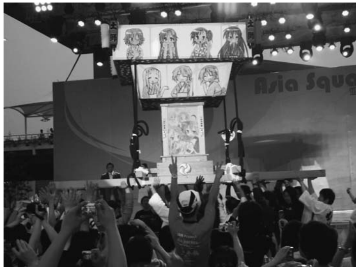
Photo 20 Portable Manga Palanquin of Washimiya Shrine