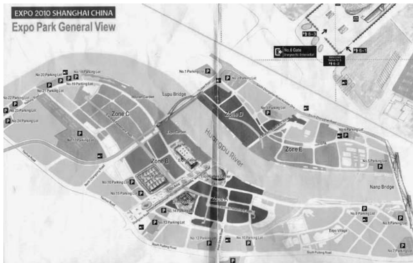
Photo 5 Zoning of the Expo Site

the Future, more pavilions of enterprises, and Urban Best Practices Areas (UBPA). The Osaka Case (pavilion) was included in one of the joint pavilions at UBPA.