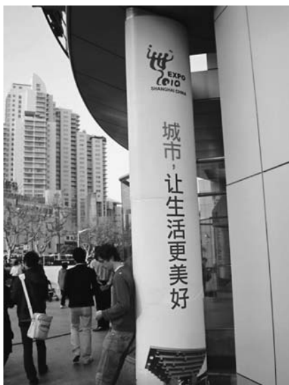
Photo 1 The Main Theme of the Expo

The Expo's theme appeared everywhere on the streets of Shanghai (photo 1), along with Haibao ("sea treasure" in Chinese), the Expo's mascot doll (photo 2). Various slogans were also presented: "世界文明的盛会 我们大家的世博 (Prosperous Event of World Civilization: World Expo for All of Us)" (photo 3) and "精彩世博 文明先行 (Wonderful World Expo, Manners First)" were the ones I came across most often. The Chinese word "文明 ( wenming )" has two meanings: "civilization" and "good manners," with the latter more commonly used. The motto of "和谐的城市 谦让的我 (Harmonious City, Modest Self)" was also prominent and suggested that the city wished to take this opportunity to improve its situation – something