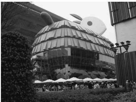
Photo 8 Macau Pavilion

The UBPA was also future-oriented, and innovative city practices from around the world were exhibited there (photo 12). Judging examples based on four criteria—“livable cities,” “sustainable urbanization,” “conservation,” and “utilization of cultural heritage and technological innovations in built environment”—the practices worth exhibiting and promoting were selected from 113 entries. Fourteen separate pavilions (including five Chinese ones)