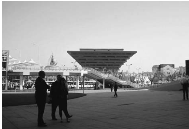
Photo 7 China Pavilion