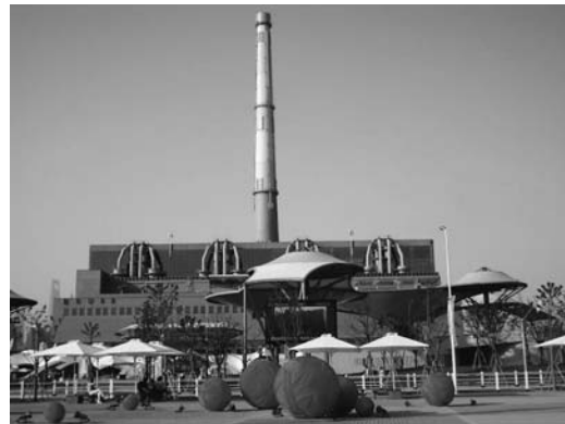
Photo 12 The Theme Pavilion of Best City Practices