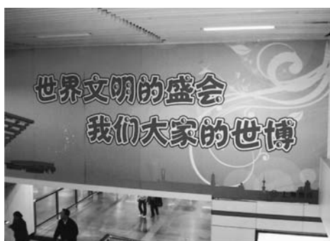
Photo 3 “Prosperous Event of World Civilization, World Expo of All of Us”

Zone D contained the Pavilion of Footprints, pavilions of enterprises, the World Exposition Museum, and the Japanese Industry Pavilion. Zone E included the Pavilion of