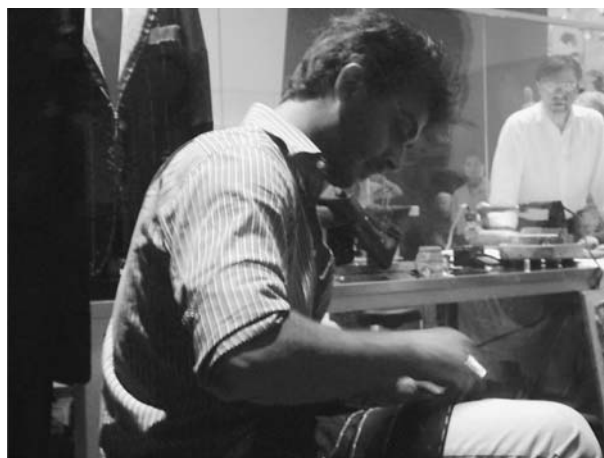
Photo 16 Dressmaker at the Italy Pavilion