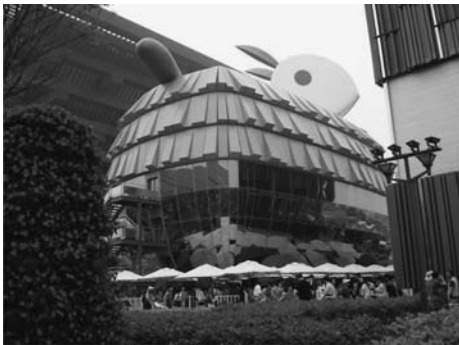
Photo 8 Macau Pavilion

The UBPA was also future-oriented, and innovative city practices from around the world were exhibited there (photo 12). Judging examples based on four criteria—“livable cities,” “sustainable urbanization,” “conservation,” and “utilization of cultural heritage and technological innovations in built environment”—the practices worth exhibiting and promoting were selected from 113 entries. Fourteen separate pavilions (including five Chinese ones)