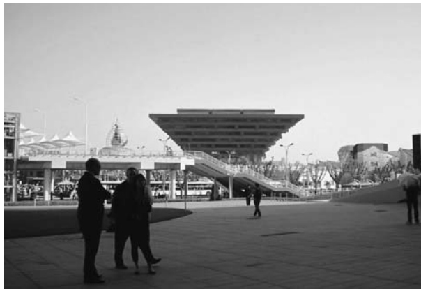
Photo 7 China Pavilion