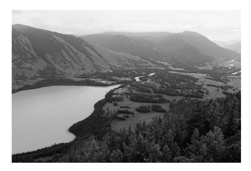
Photo 4 Kanas river. Since 2012, Xinjang province of China.