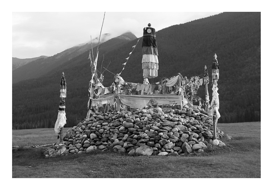
Photo 5 Kok Monchak's ovoo, altar of area's "owner," seen as of today. Photo by I. Lkhagvasuren, 2012, Xinjang province of China.