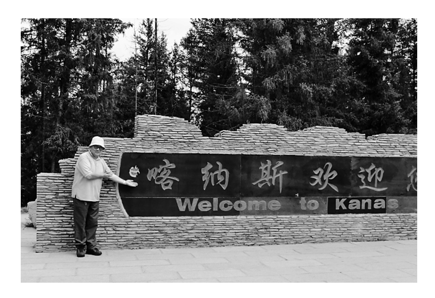
Photo 6 Tourists visiting Kanas from the central China. Photo by Y. Konagaya, 2012, Xinjang province of China.