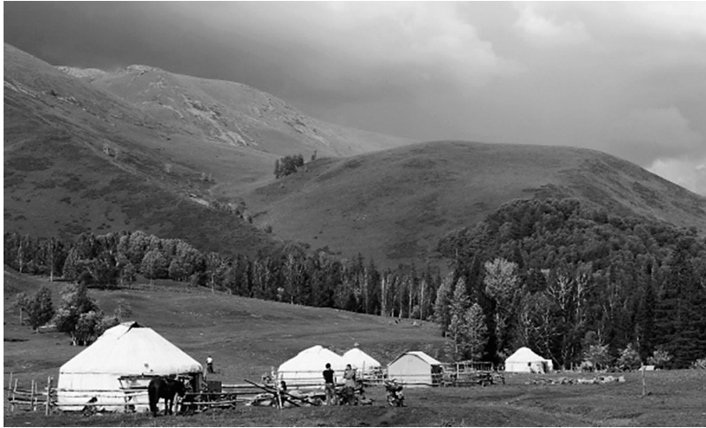
Photo 4 Typical Kok Monchak landscape today. Photo by I. Lkhagvasuren, 2012, Xinjiang province of China.

as Mongols on their passports but do not tend to identify themselves as Mongols. This problem gives rise to a number of important questions.