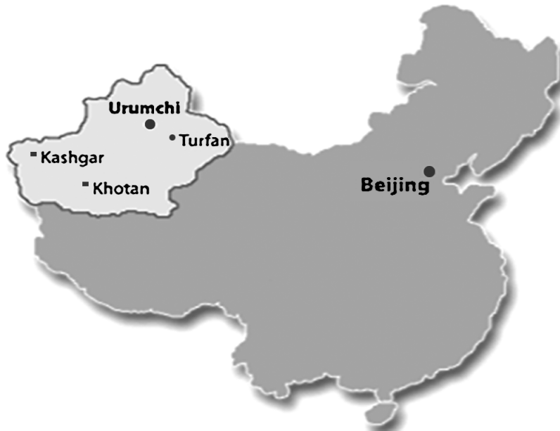
Map 2 The majority of the Tuvan population in China lives in the Habahe and Burjin Districts of Kazakh Autonomous Province. Some also live in the Altai, Koktogai, Chingil, and Burultogai Districts.