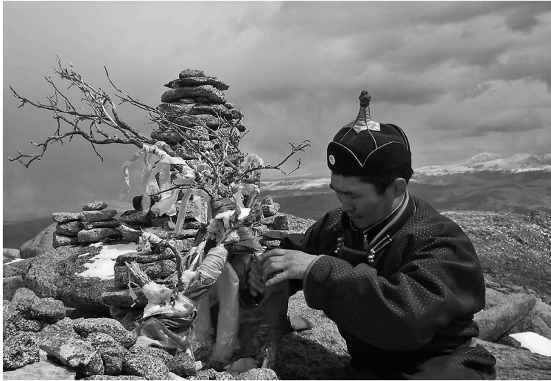
Photo 2 Tuvan sacrifice to the spirit of the landscape. Photo by Marina Mongush, 1994, Tsengel sum , Mongolia.

while the others either live in the center of Tsagaannuur sum or herd steppe-based livestock in valleys throughout the area (Wheeler 2000: 6–7).