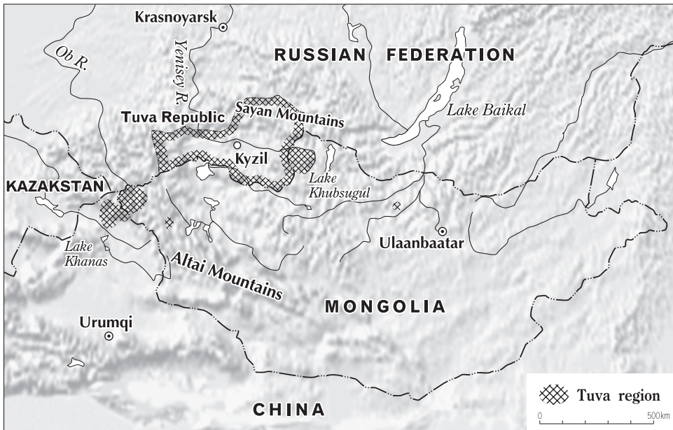
Map 1 Most Tuvans (who, according to the 2002 census, number 243,442) live in the Russian Federation, where they have a recognized position and territory, the Republic of Tuva. These Tuvans are considered citizens of Russia.