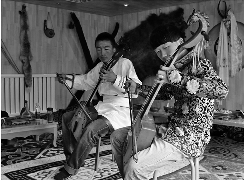
Photo 5 A musical instrument of Kok Monchak people—morinkhuur. Photo by I. Lkhagvasuren, 2012, Xinjiang province of China.

have not had the chance to do so. They also lack access to media in their own language: there are no newspapers, books, radio, or TV programs to guarantee the permanent use of the Tuvan language. Occasionally they attempt to receive by transistor the Tuvan radio station, which is their only opportunity to listen to their native language. Listening to Tuvan radio programs convinces them that they have not yet lost their language, but many informants complain that the broadcast is very short—just 30 minutes every evening.