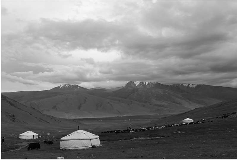
Photo 3 Typical Tuvan landscape today. Photo by I. Lkhagvasuren, 2012, Tsengel sum , Mongolia.

aspects of their Tuvan ethnic identity (Lars Hojerand, Alan Wheeler, personal communication).