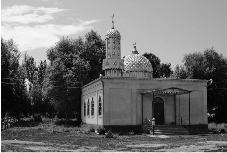
Photo 1 Boru-Bash Mosque

contemporary Sartkalmaks of Kyrgyzstan realize that their people originated in an ancient land, East Turkestan, where Islam had spread by the 14 th and 15 th centuries among the ancestors of the Sartkalmaks, the Olods. Those Olods, an Oirat people, had no relationship with Russian Kalmyks. Islam is for Sartkalmak society a stable component of the traditional worldview, a phenomenon that illuminates ancient Kalmak tradition, and an implicit hint to the Kyrgyz majority, which is Muslim, in the Issyk-Kul region. Being a “real Muslim” is important to the Sartkalmaks in Kyrgyz society. To the Kyrgyz people, the Kalmaks seem more religious and more likely to visit a mosque, perform prayers, follow the precepts of Islam, and refrain from consuming alcohol.