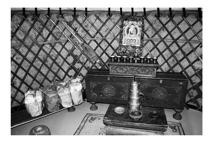
Photo 1 The interior of Tuvan traditional yurt. Collection of Museum of History, Republic of Tuva, Russian Federation. 2012.

have acknowledged the ethnic bonds between Mongol and Tuva in important ways. The second volume of Tuva's history, published in 2007, points out that "these two nations have a centuries-old common destiny through their nomadic way of living, administrative and territorial structure, and Buddhism, as well as the involvement of some Mongol tribes in Tuva's nation-building process and the joint expeditionary wars that made them much closer." (Lamin, eds. 2007: 9)