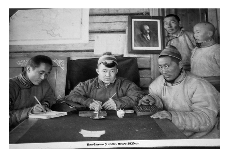
Photo 2 Tuvans (1920).

saying that the banners of Uriankhai were not Mongol at all.<sup>10)</sup>