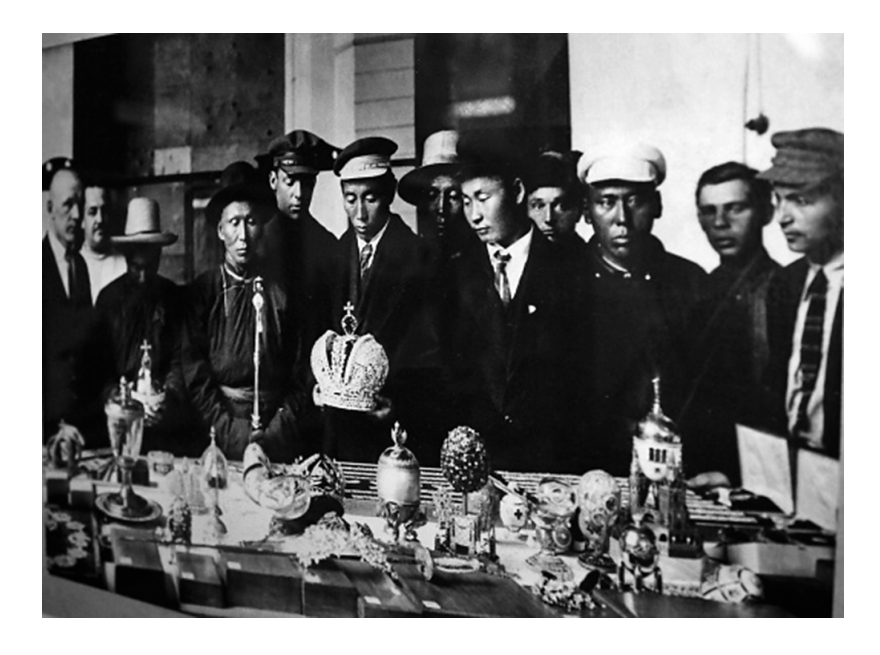
Photo 4 Tuvan delegation visiting Moscow in 1920.