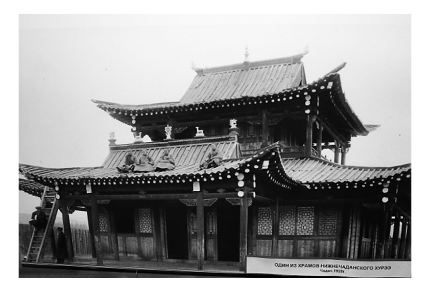
Photo 3 Buddist monastery in the Chadan region, late XIX century.

The note instructed the region's noblemen to keep quiet until the Tripartite Agreement was concluded, as it would define their respective territories and subtly persuade the Uriankhais to maintain a low profile and wait for an eventual solution.<sup>17)</sup>