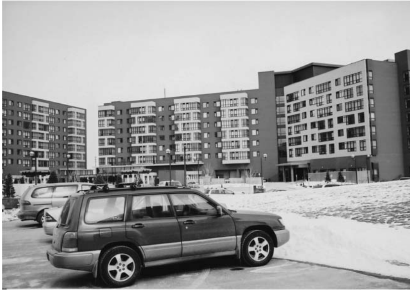
Photo 4 Condominium for both the elderly and the younger generation