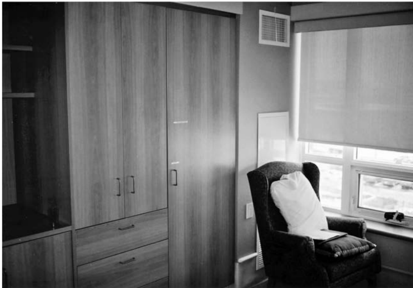
Photo 5 A single room in a Japanese wing for Japanese-Canadians