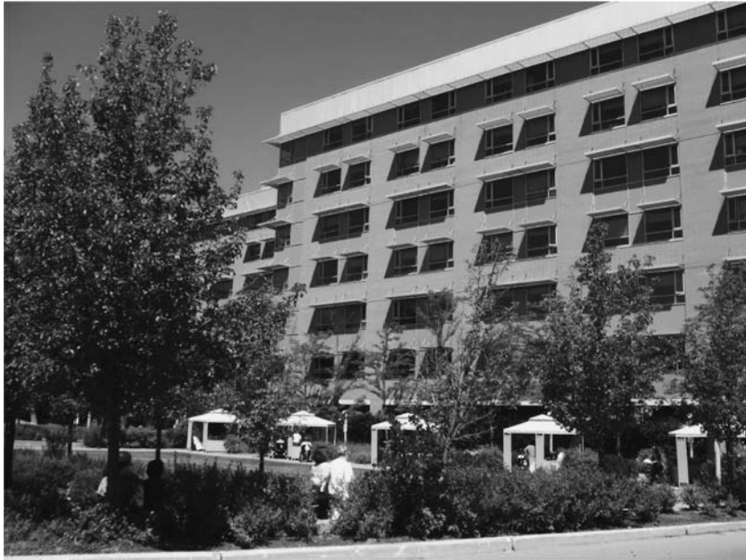
Photo 2 A Jewish facility installed next to the hospital