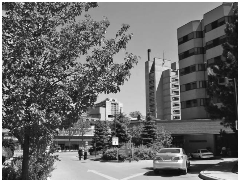
Photo 1 A Jewish hospital serving many people suffering from Alzheimer’s disease

In the next section, we will explore the development of a facility that has tried to serve people of diverse cultural backgrounds.