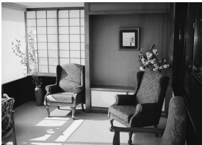
Photo 8 Collaborative creation of common space that has a Japanese atmosphere in a public long-term care home