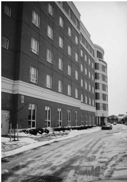
Photo 3 Nursing home and Dialysis Center of Yee Hong (Photo taken by Nanami Suzuki, Toronto)