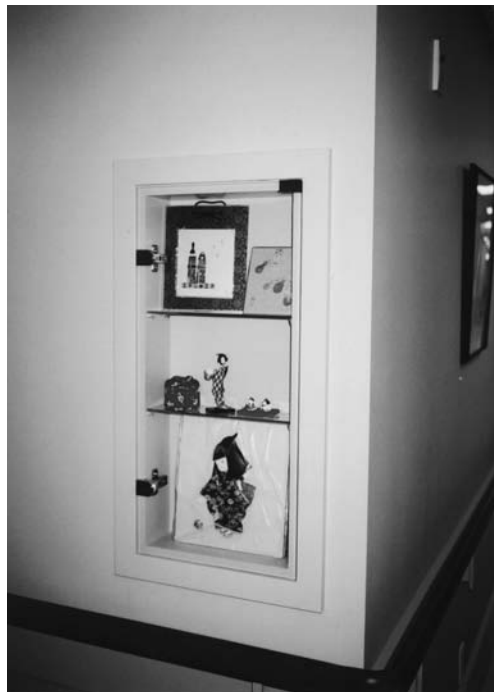
Photo 6 A memory box in a wing for Japanese-Canadians