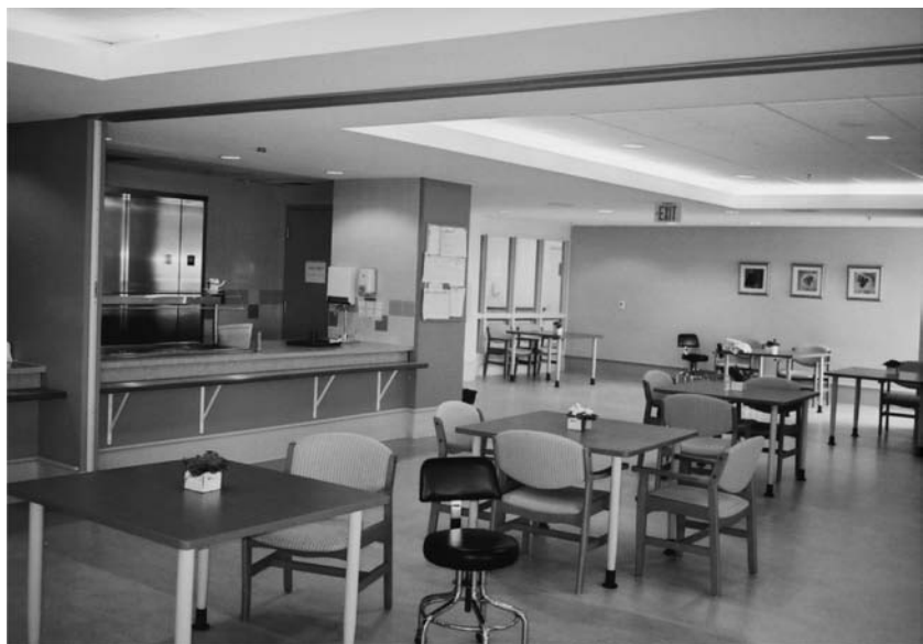
Photo 9 Dining room at Yee Hong