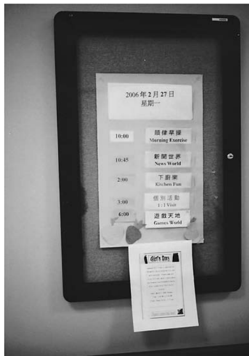
Photo 7 A schedule of activities

We were surprised to see people in their nineties like Ms. B taking lessons in the