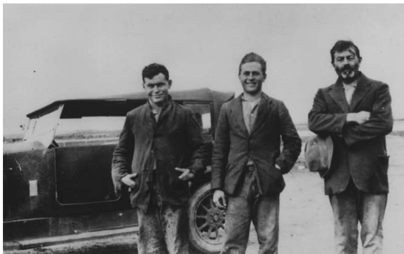
Photo 2 Immigrant family, 1930s: Wheat farmers in Western Australia

inability to read or write in one's mother language—presents particular problems in relation to ensuring optimal quality of life, health, and well-being for CALD men as they grow older.