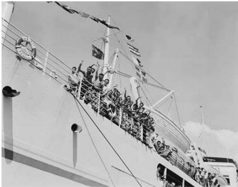
Photo 1 Migrant arrivals in Australia: Italian canecutters arrive at Cairns aboard the Aurelia