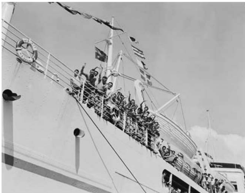
Photo 1 Migrant arrivals in Australia: Italian canecutters arrive at Cairns aboard the Aurelia