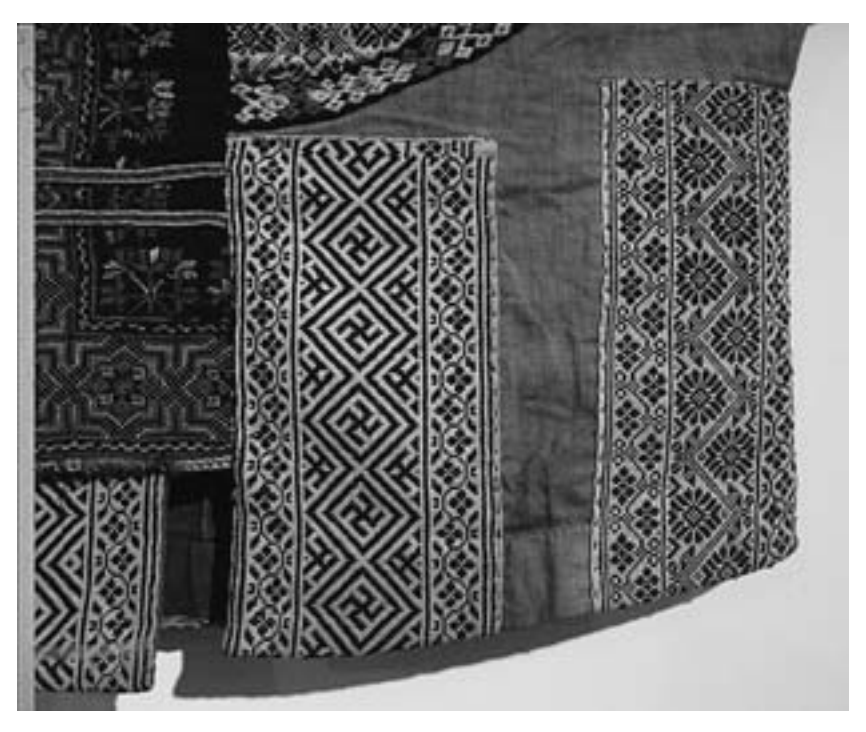
Figure 5 Rukai costume (Collection of National Museum of Ethnology, Japan, 2013)

through their belongings and clothes. The chief and aristocrats are able to wear lavish costumes, and the motif of the hundred-pace snake is a symbol used in the embroidery of the cloth used to make garments for the chiefs.