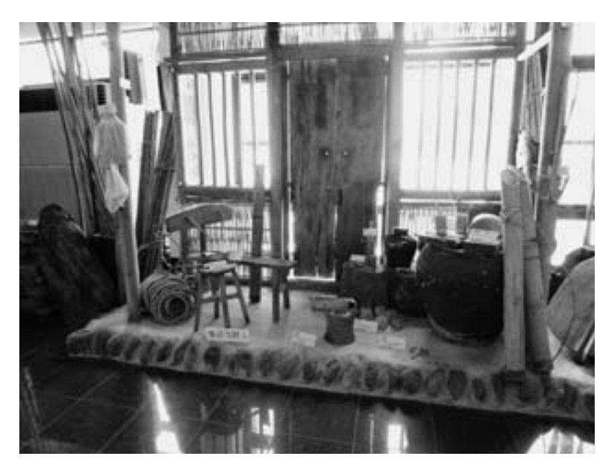
Figure 3 Exhibits in the Xiaolin museum (Xiaolin, 2012)

In 2009, Taiwan was hit by the Monakot typhoon. The Siraya villages suffered extensive damage, as did most of the indigenous villages. Almost all the houses in Xiaolin, one of the Siraya villages, were swept away by an avalanche of rocks and earth. In the process of restoration, they built a museum near the housing that was constructed after disaster. The villagers planned the museum exhibits, attempting to reconstruct their daily life before the disaster. The exhibit had two components. One was about the life in the previous Xiaolin village, which the village's elderly people attempted to recover. The exhibit included both objects which existed or were used in Xiaolin villages up until the typhoon, and those which had already disappeared before it. The other was a display about Pingpu culture and history, including that of the Siraya. It included illustrations from historical documents and pictures taken by the scholars during Japanese colonial period. It was very important for the exhibit to have objects representing the Pingpu and Siraya peoples and showing their ethnicity. The museum exhibited what the Xiaolin village had been like or what Xiaolin villagers believed it to have been like, and what the historical documents or ethnographies had represented about the Pingpu and Siraya. In fact, there was no direct relationship between these two forms of representation (Figure 3).