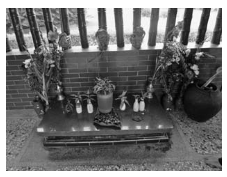
Figure 2 An Ali altar in kongai (Kabasua, 2013)

During the period of Japanese colonialization of Taiwan, the colonial authorities tried