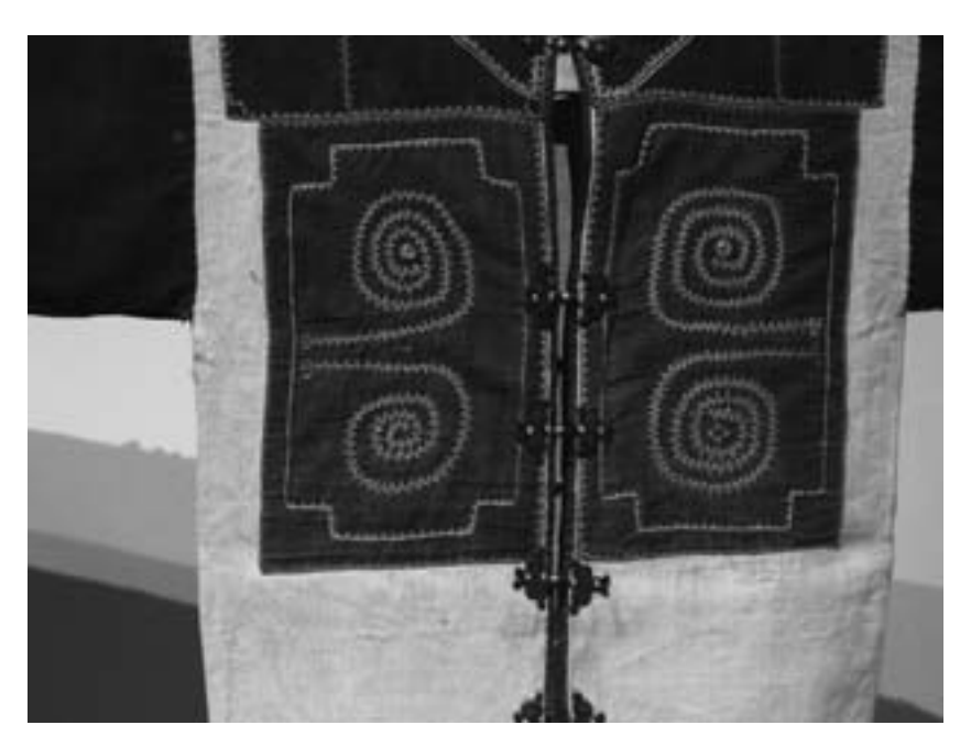
Figure 4 Makatao costume (Collection of National Museum of Ethnology, Japan, 2013)

The jacket is made in the Chinese style and the both of the main front pieces are sewed from pieces of cloth with a particular embroidered decoration. It is the embroidery that models the hundred-pace snake, which is believed by the Paiwan and the Rukai groups to be an ancestral reincarnation (Figure 4). The use of the hundred-pace snake motif is permitted in only the materials owned and used by the chief or the aristocrats in the Paiwan and Rukai societies. Both societies are hierarchical, and can be divided roughly into the aristocrats' class and the commoners' class. The chief and aristocrats have ritual superiority over the commoners, and they have gotten married within their own class. The classes are distinguished