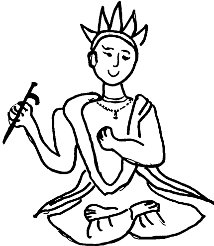
Figure 4 The yogin condenses his psychic energy to the extent that the hook in his hand is real.