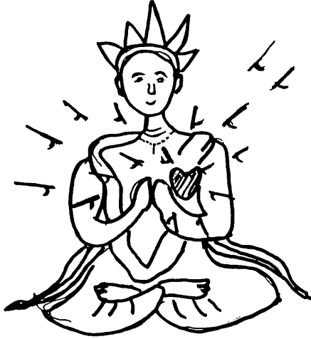
Figure 2 All the hooks are coming to the heart of Vairocana, i.e., a yogin.