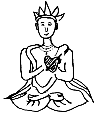
Figure 3 Those hooks become a large hook in the heart of the yogin.