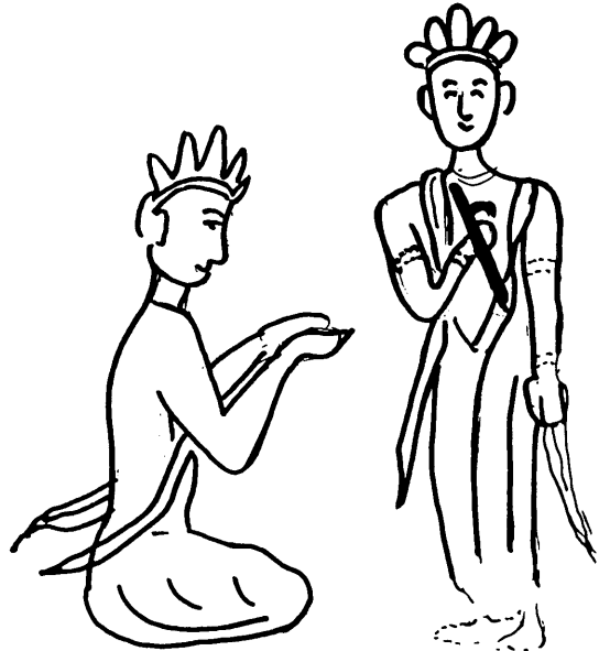
Figure 5 The yogin offers the hook to Sarvatathāgatas, then the deity whose symbol is a hook, i.e., Dharmarāja, appears in front of the yogin, and has his seat in the Vajradhātu Mandala.