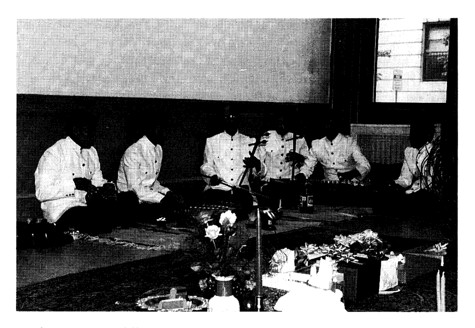
Photo 1: Wedding ensemble (Philadelphia, 1984)

two forms of theater—yike (folk theater) and basakk (theater of Chinese origin)—which are occasionally staged. Among the approximately two dozen music ensembles, kar (wedding), pinn peat (court), and mohori (entertainment) ensembles are found prominently in the current practice. The most popular form of all is modern urban (or popular) music, primarily ballroom dance music, movie music, and "pop songs."