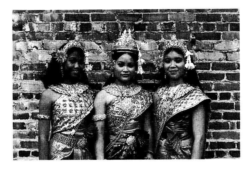
Photo 4: Three second-generation Cambodian dancers in the US (Greensboro, North Carolina, 1995)

Most of the quarter million Cambodians who live in the United States are concentrated in two locations, Long Beach (California) and Lowell (Massachusetts), but smaller groups are found in Washington, D.C., Seattle, and Philadelphia. Wherever possible, the Cambodian communities maintain traditional customs and observe as many of their religious and national festivals as possible. As with most immigrant groups, however, the younger generation now coming of age in North America is strongly inclined to adapt themselves to their new environment. A small minority has striven to maintain the artistic traditions of their homeland.