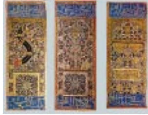
Fig.12 A richly decorated set of playing cards of Mameluke origin, preserved in the Topkapi Museum in Istanbul, Turkey