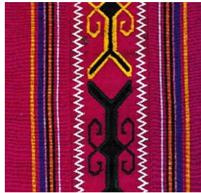
Fig.9 A detail of a textile from the Maranao people, Mindanao