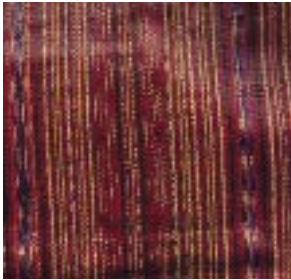
Fig.8 Banana fiber cloth from the Bagobo, Mindanao