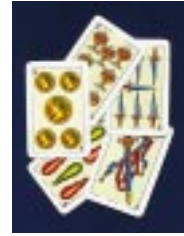
Fig.13 Naipes, Spanish style playing cards used in Spain and in Latin America