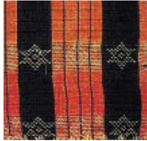
Fig.6 Kalinga textile from Northern Luzon