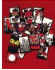
Fig.11 Karuta, or Hanafuda Japanese game cards