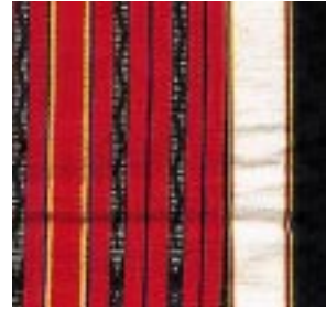
Fig.7 Bontoc textile from Northern Luzon