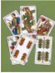
Fig.10 Skat, traditional German Playing Cards