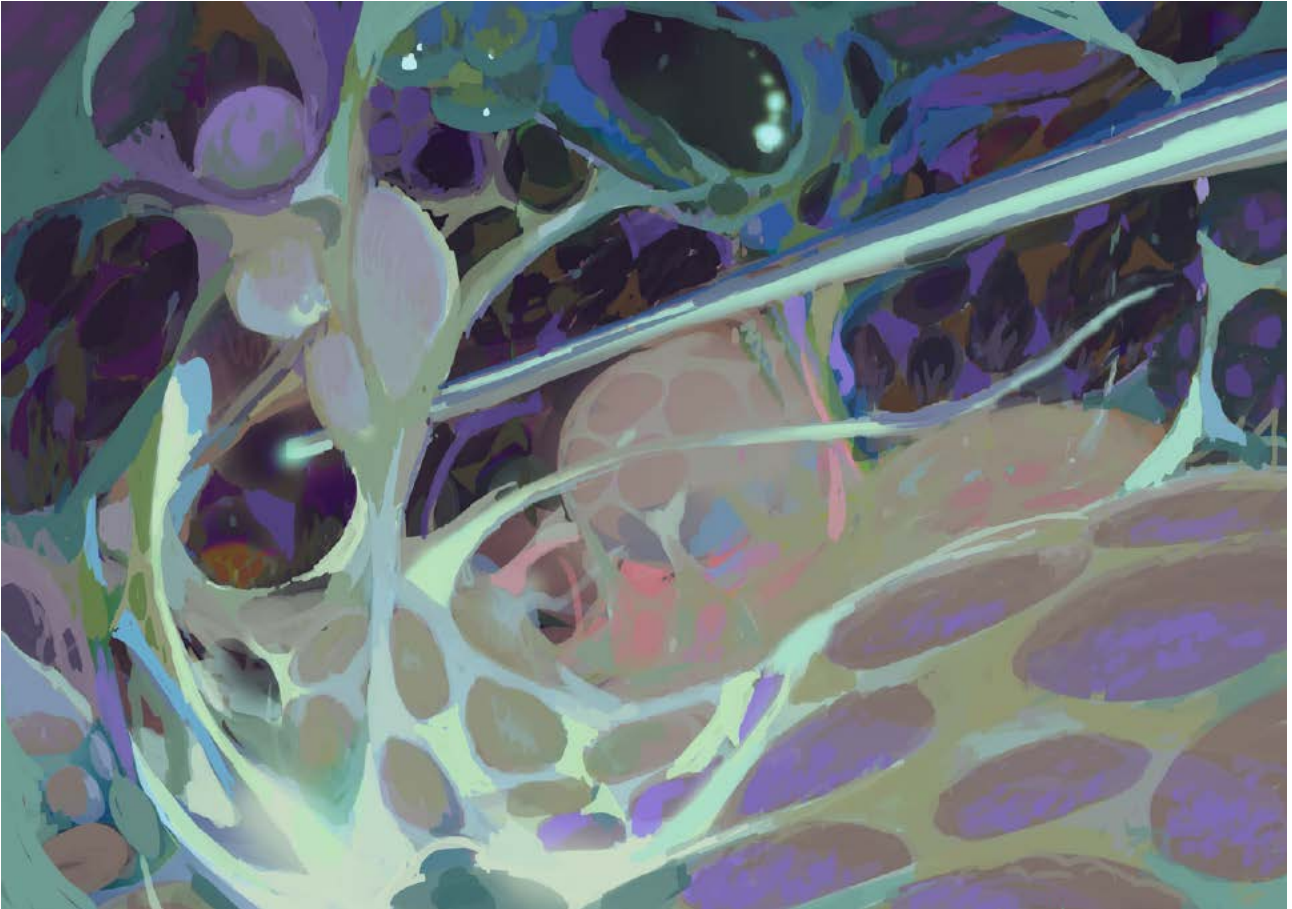
Figure 4 Illustration by Emil Friis Ernst of the Inside of the Patient's Shoulder, Created Uniquely for This Submission (©Emil Friis Ernst, Medical Museion)