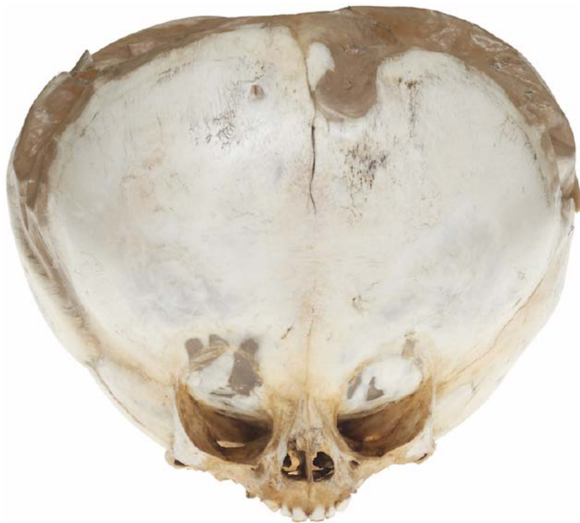
Figure 2 Contemporary Art Photograph of a Specimen from the Nineteenth Century: The Skull of a Child Who Suffered from Hydrocephalus