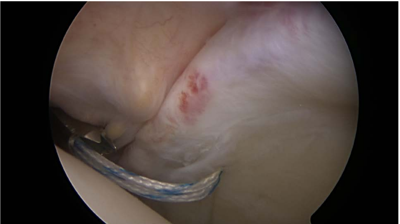
Figure 1 Medical Image from a Keyhole Surgery (Arthroscopy). The image shows the inside of the shoulder joint of an orthopaedic patient.