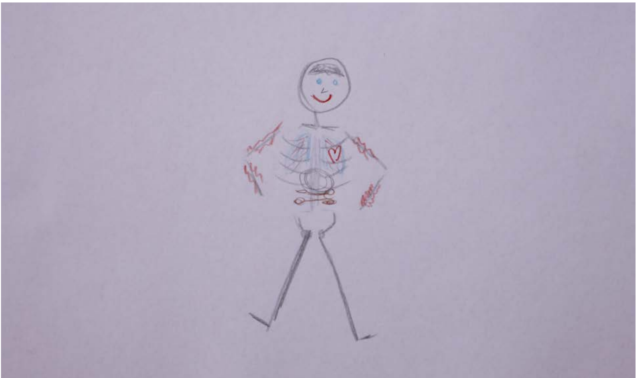
Figure 3 Pencil drawings by the patient whose shoulder image is depicted in Element 1